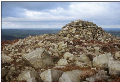
Pike Low summit at the head of Ewden Dale