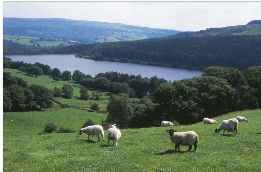
Dale Dike Reservoir, Bradfield Dale