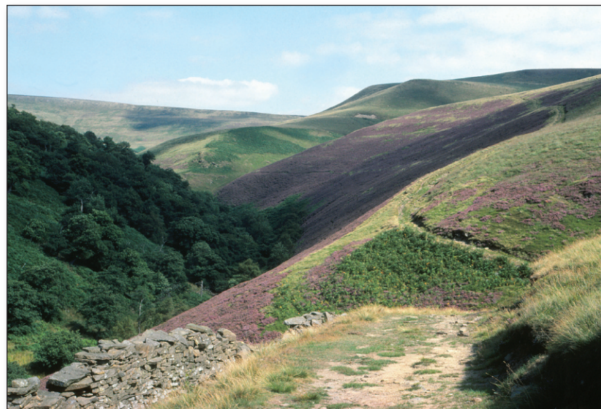
Looking up Abbey Brook, late summer