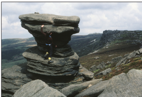
The Salt Cellar, Derwent Edge