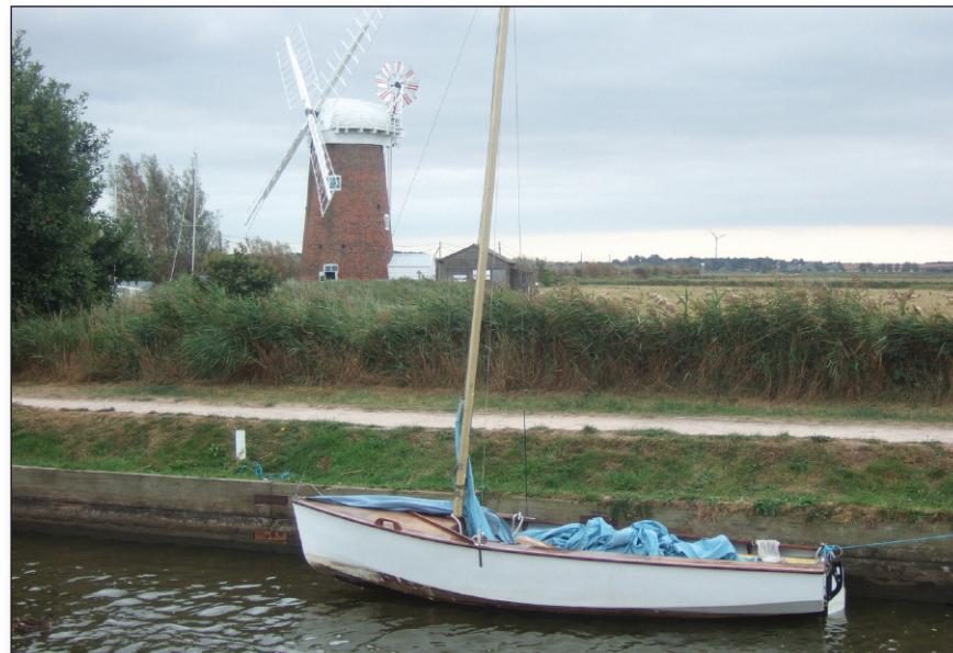
Sailing dinghy tied up by Horsey Mill.