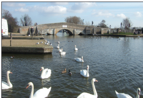
Potter Heigham Bridge from the west.