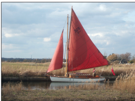
Traditional sailing boat on the River Bure.