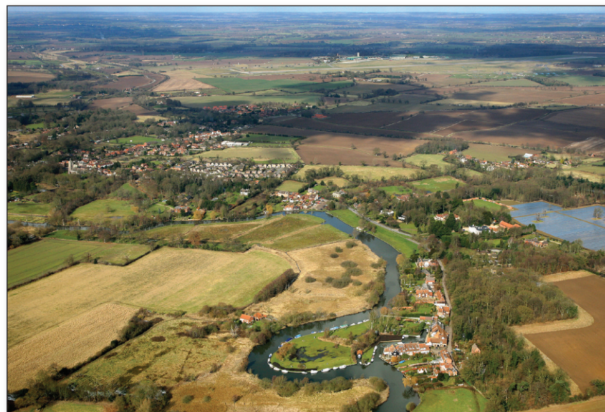
Looking north-west over Coltishall and the River Bure.