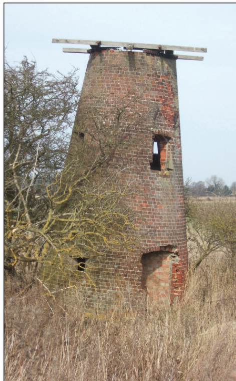
Ludham Bridge North Drainage Mill.