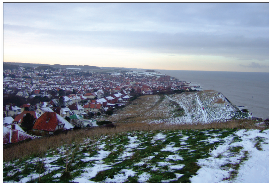
Sheringham from the Hump under light snow