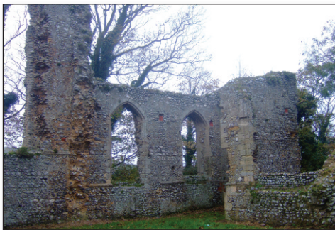
Beeston Priory ruins