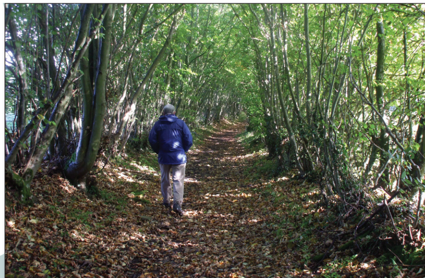
White's Wood offers a pleasant stroll