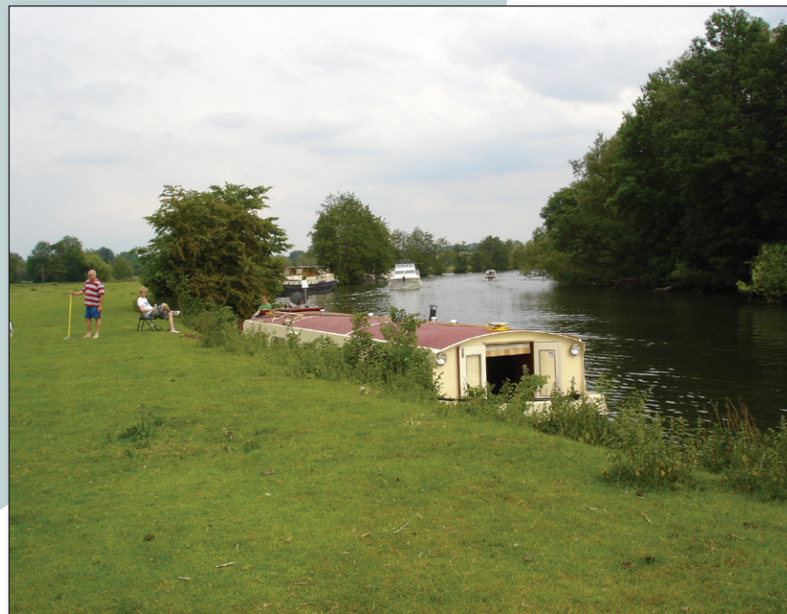
Moored for the day