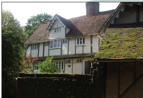
Hedgerley House with daub and wattle