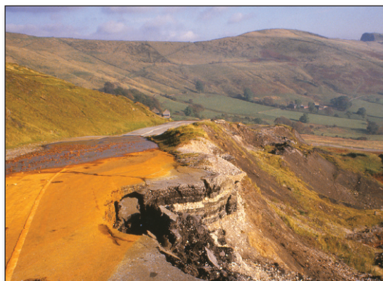
Collapsed road below Mam Tor.