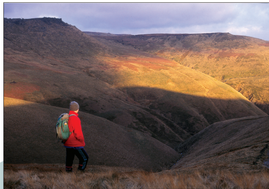
The Cloughs from Jacob's Ladder, Kinder Scout.