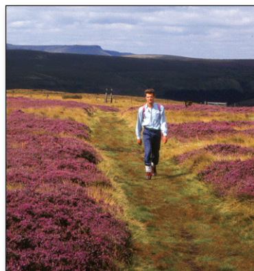
Late summer above the Ashop Valley.