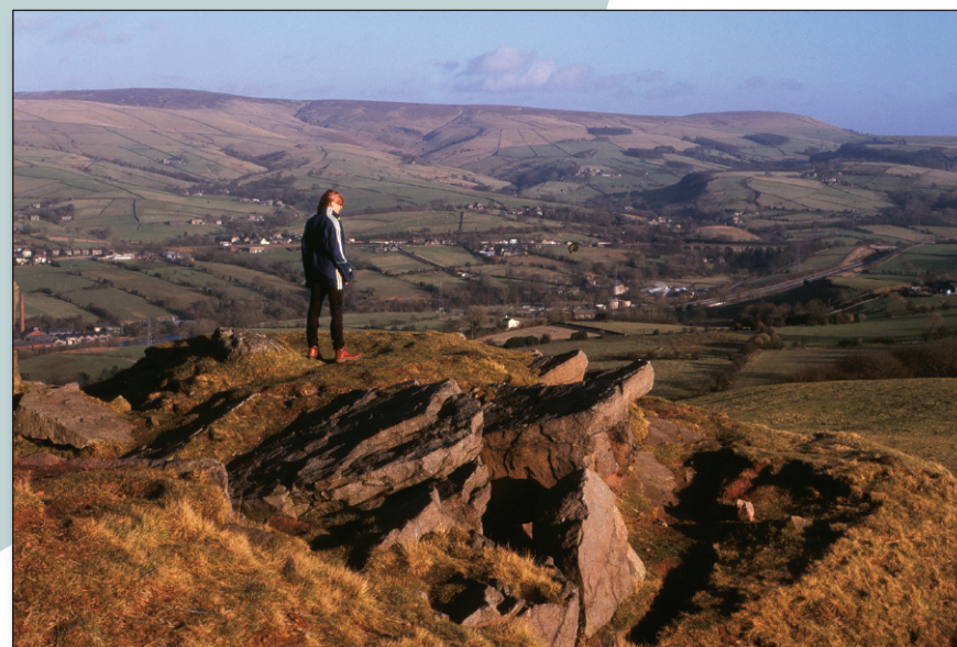
Looking to Roych Clough from Eccles Pike.