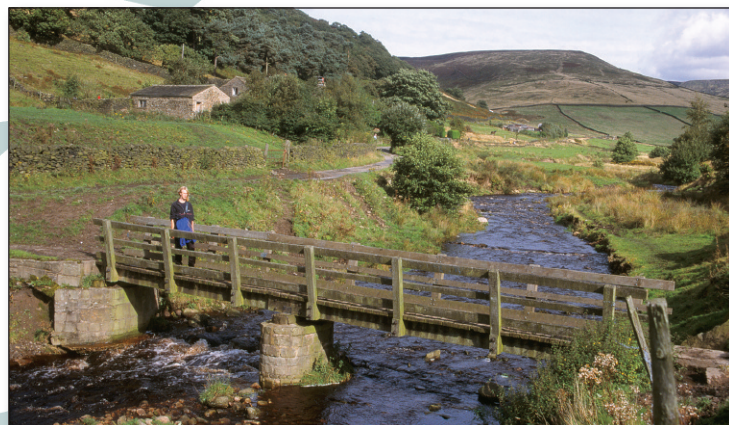
Right: The Shelf Brook below Mossylee Farm.