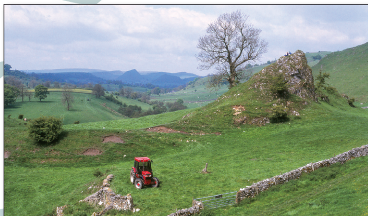
Right: Pilsbury Castle mounds, Upper Dove Valley.