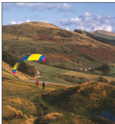
Paraglider on the slopes of Mam Tor.