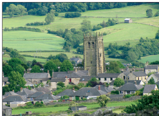
Youlgreave village from Back Lane.