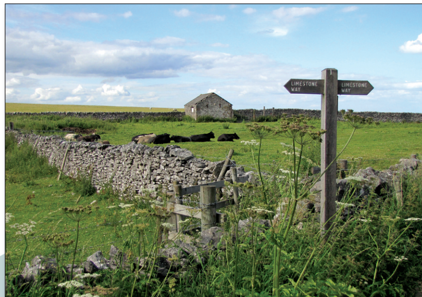
The Limestone Way above Cales Dale.