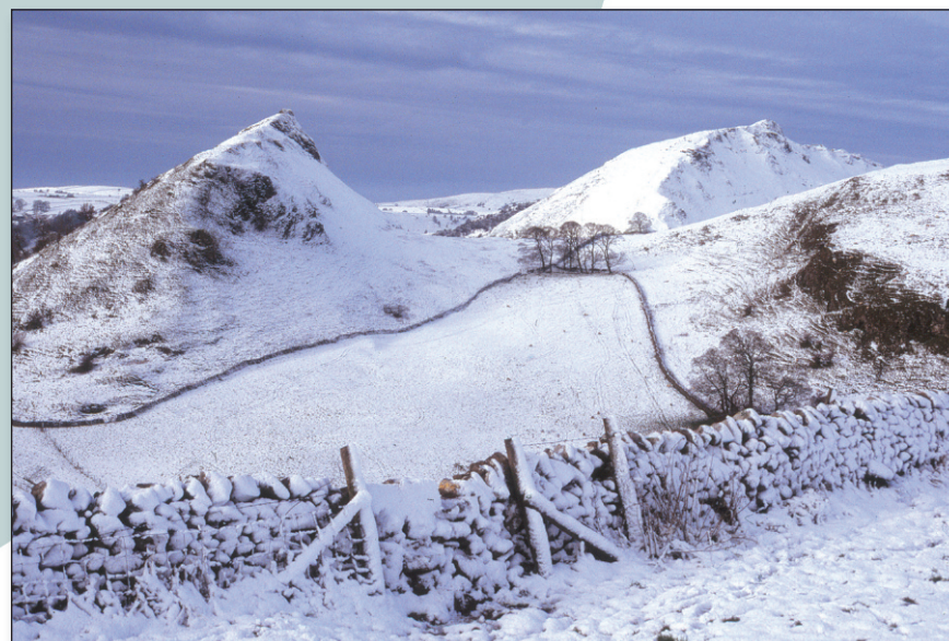
Parkhouse Hill (left) and Chrome Hill from above Glutton Dale.