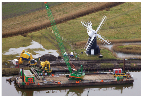
ASHTREE FARM MILL Photographed during river bank re-profiling and piling works on the River Bure in 2010. This mill was one of the last to be built in the fens (1913-2). It was built by Smithdale of Acle on a restricted budget with much material saved from other mills but with some innovative use of cast iron too. It was also one of the last mills to work. Mr Barham, the marsh farmer, continued to use it even after diesel and electric pumps had been installed nearby. It finally ended work when the sails were torn off in the gales that triggered the 1953 east coast floods. Fifty years on, it was restored 2003 to 2006 by millwright Richard Searge as part of the Norfolk Windmills Trust's 'Land of the Windmills' project.