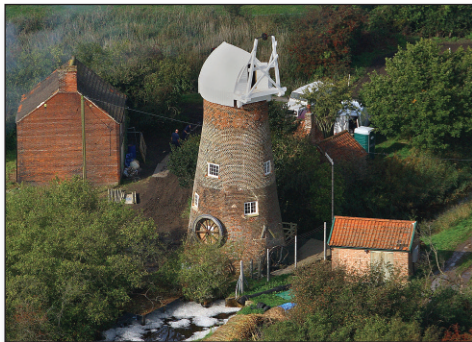
Top: Horning – St Benet's Level.