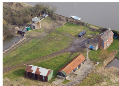
ACLE – HERMITAGE This former mill tower was truncated and converted into part of an engine house by Smithdale of Acle.