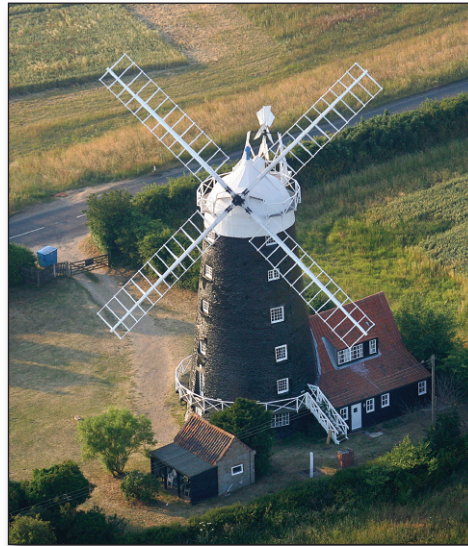
Above: Burnham Overy. One of the well known Norfolk coastal landmarks.