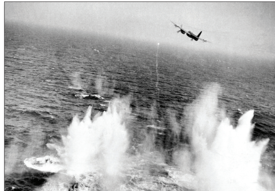
Towards the end of the war, German U-boats began to be encountered on the surface more frequently by Banff Strike Wing and were attacked without mercy.