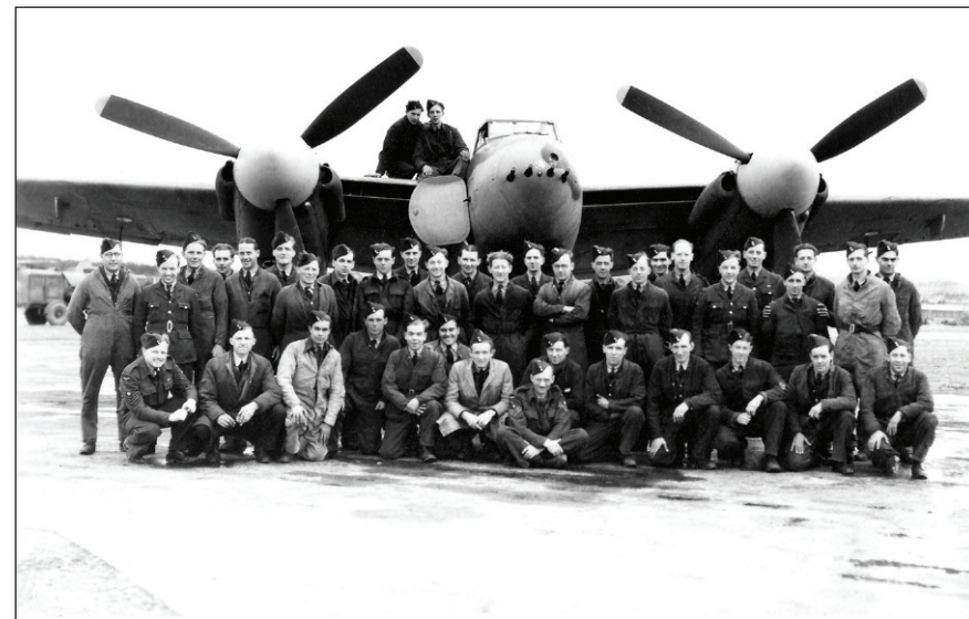
An impromptu group photograph of 235 Squadron ground crews at Banff.