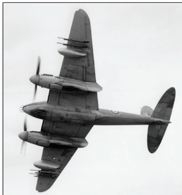
The ultimate configuration of the anti- shipping version of the De Havilland Mosquito FBVI, that was unique to Banff Strike Wing and it's operations.