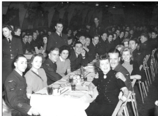
Christmas 1944. Airmen and NCOs bring wives and local girlfriends along to enjoy the feast.