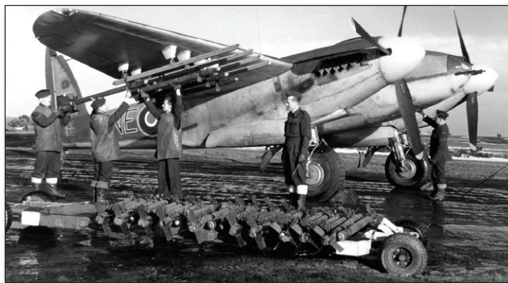
Right: An enormous amount of rockets were required to keep the Mosquitoes of Banff Strike Wing in action.