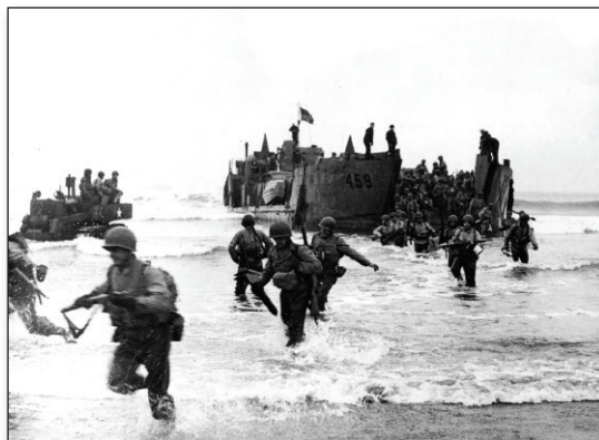
American troops are disgorged from the bows of a landing craft during exercises on Woolacombe beach, 1943.

Right: While on his visit in May 1941, Churchill surveys the destruction to the naval dockyard at Devonport.