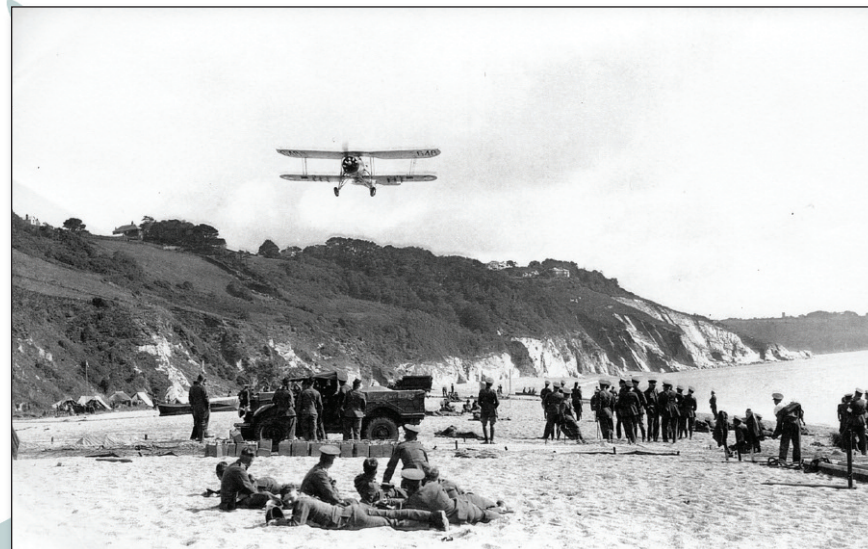
Slapton Beach, July 1938. A Fairey Swordfish, playing the role of a bomber, flies over the beach from HMS Courageous anchored in the bay.