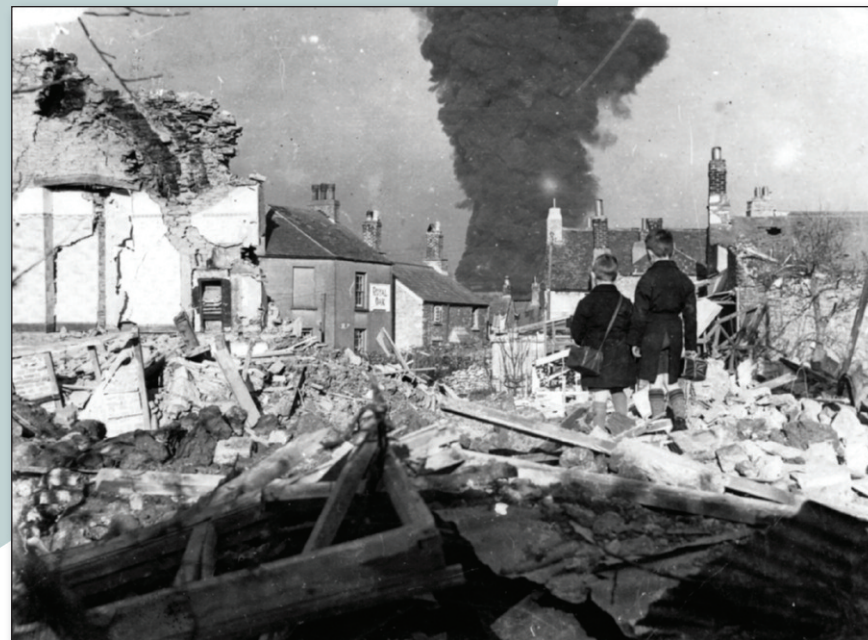
Two tiny figures gaze out on the ruins of their homes following the raid on Plymouth in November 1940. Smoke billows from the blazing Turnchapel oil tanks.