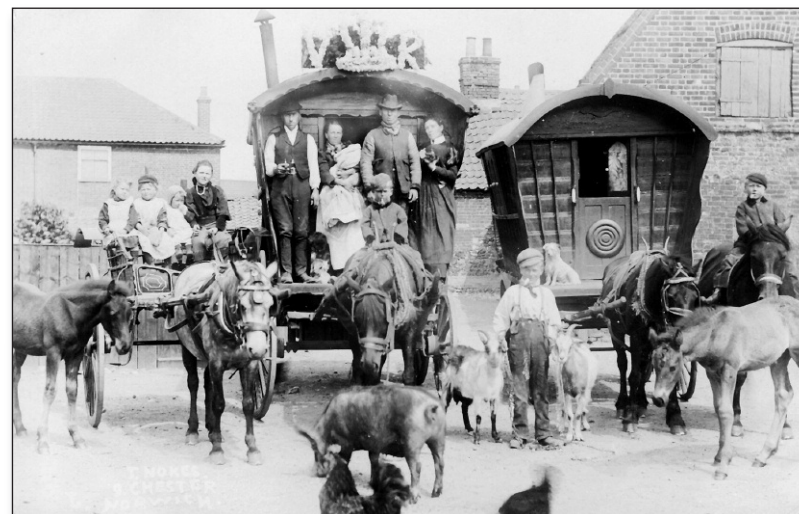
A group of gypsies in a village with a cart, two traditional caravans, horses, goats, a pig and chickens. A lovely decoration on top of the central van with VR and a crown denotes Queen Victoria's Diamond Jubilee.