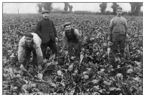
Above: Dutchmen raising sugar beet, 1907. These men travelled to Norfolk from the Continent as farm labourers early in the year and stayed until after the sugar beet had been lifted in the winter.