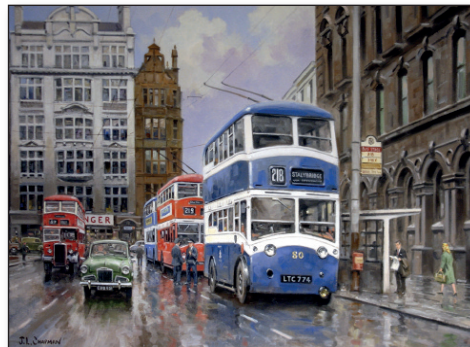
Manchester Trolley Bus