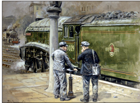
Woodcock Takes on Water