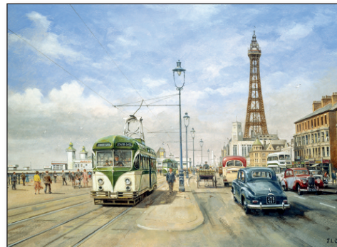
On the Promenade, Blackpool Circa 1952