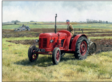
David Brown Cropmaster Tractor