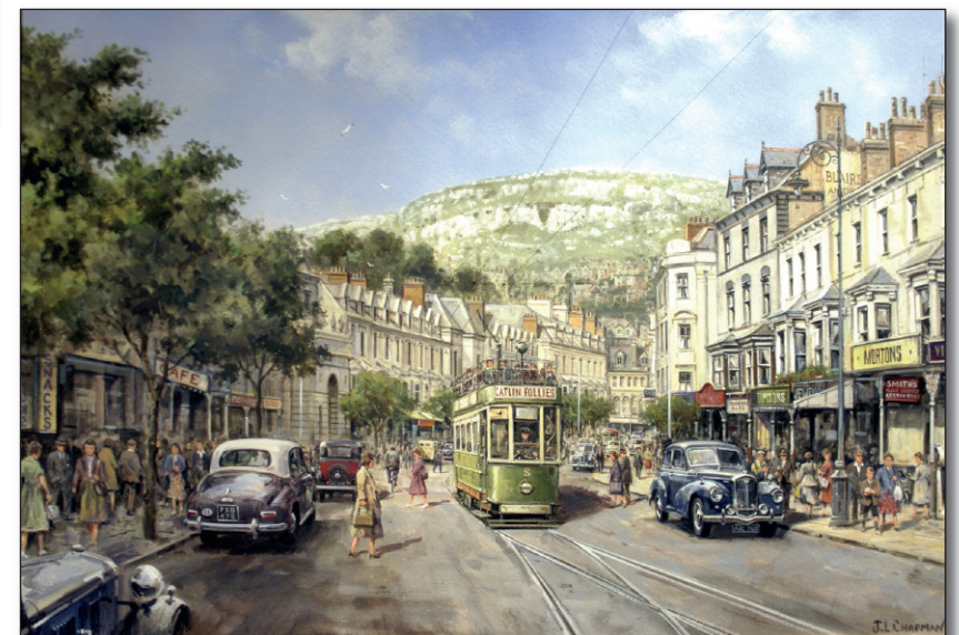
Mostyn Street, Llandudno 1950s