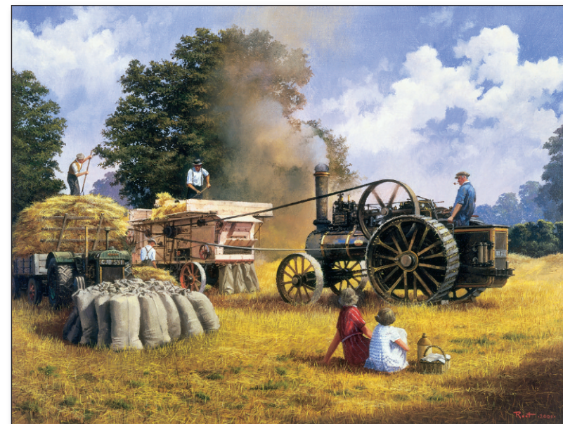
Fowler Engine Threshing