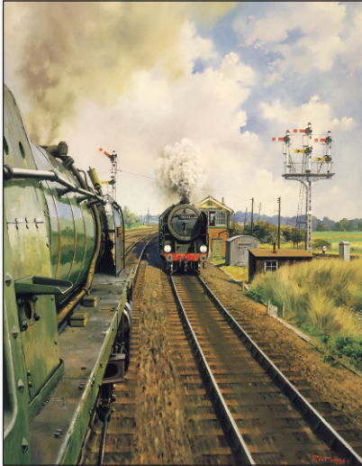
Britannias at Ely