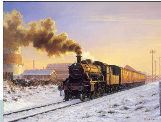
Below: Example of a double-page spread.