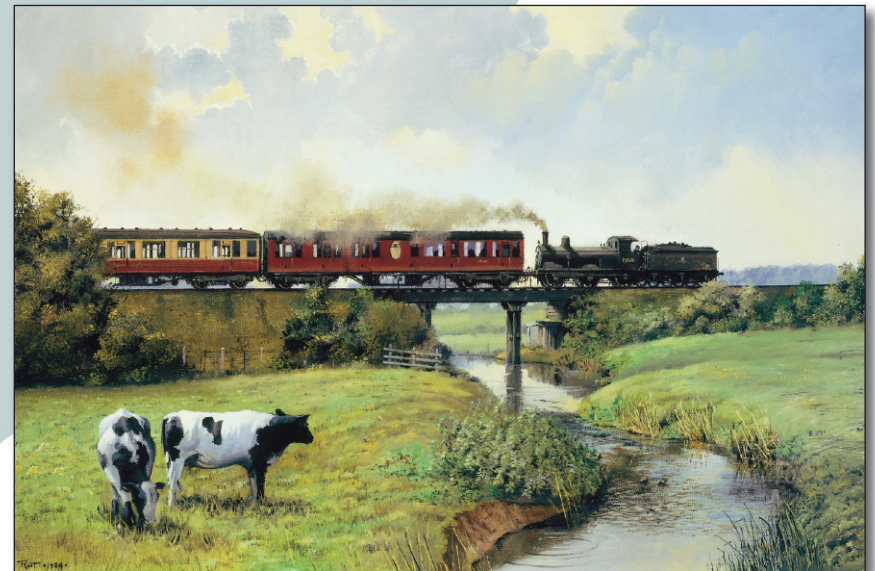
Hepworth Hall Bridge