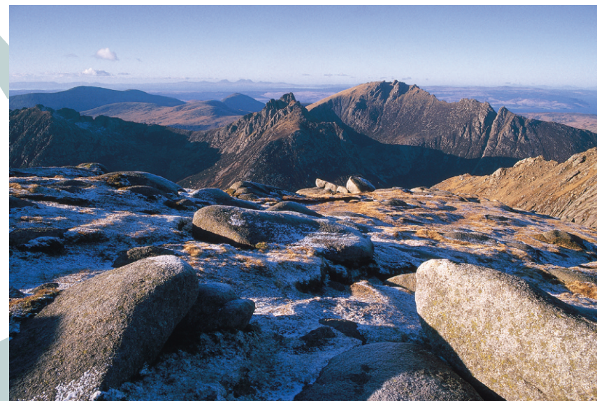
Towards the Hebrides. A wintry view from the 874m granite summit of Goat Fell, Arran's highest mountain.