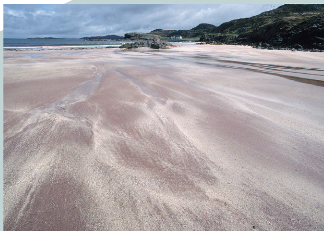
Above: The broad pinkish sands of Clashnessie Bay on the Rhu Stoer peninsula.