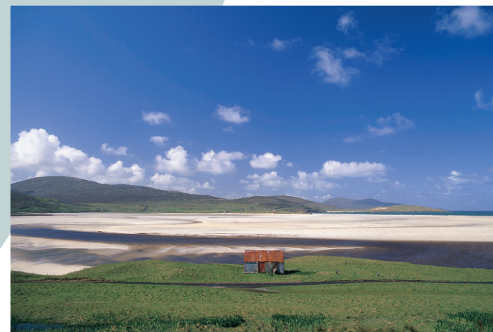
A wide view looking south from Luskentyre on a glorious late spring day towards distant Toe Head.