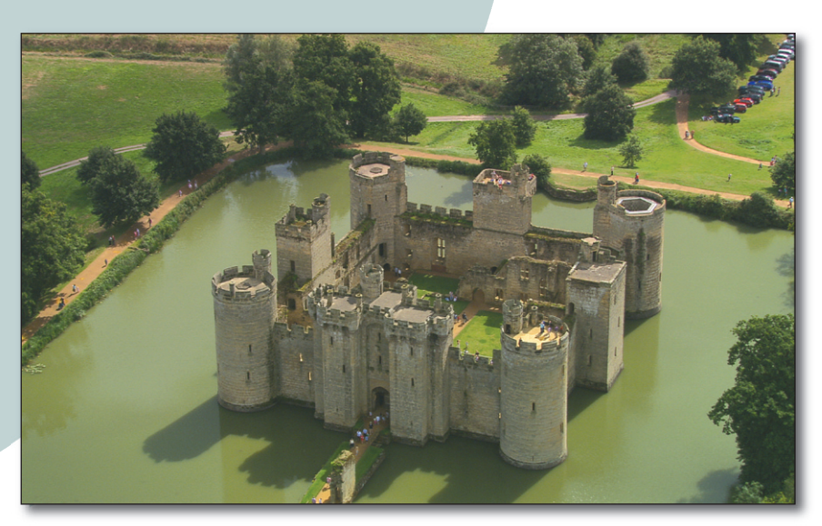
Bodiam's moat may have been as much for show as defence, but certainly gives it a 'fairytale' appearance.