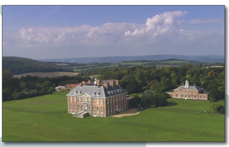
Uppark was given to the National Trust in 1954 and was regarded as a jewel because of its carefully-preserved original decoration.