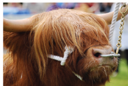
A fine head.