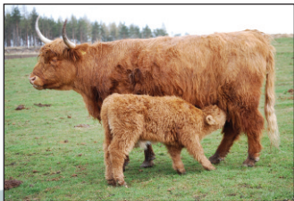
Feeding from mum.