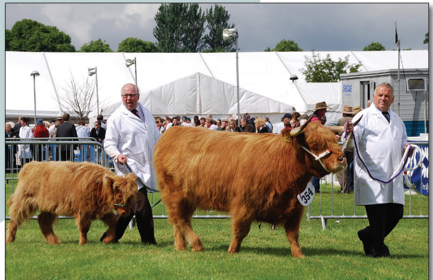
Cow with calf at foot being shown together.