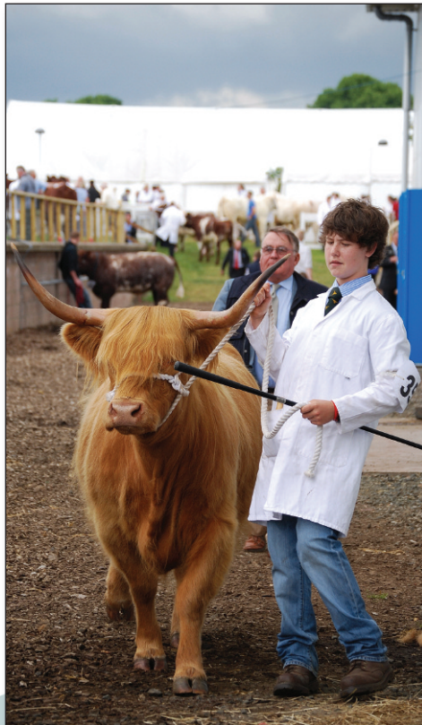
Youngsters of all ages are involved with the showing of Highland cattle.