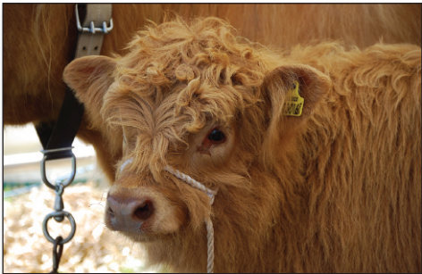
An adorable face.