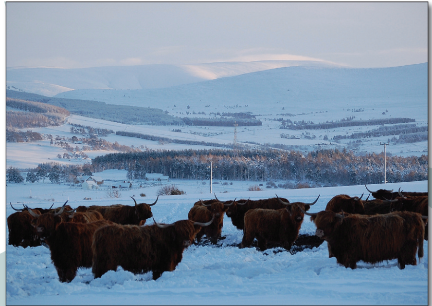
Shaggy coats protect from the cold.