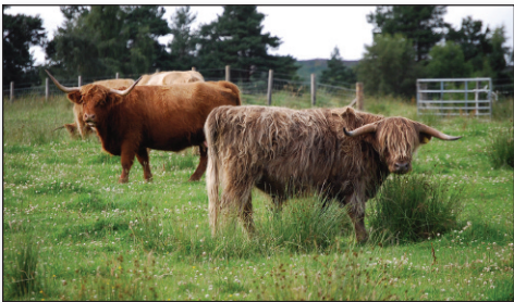
Out at grass.