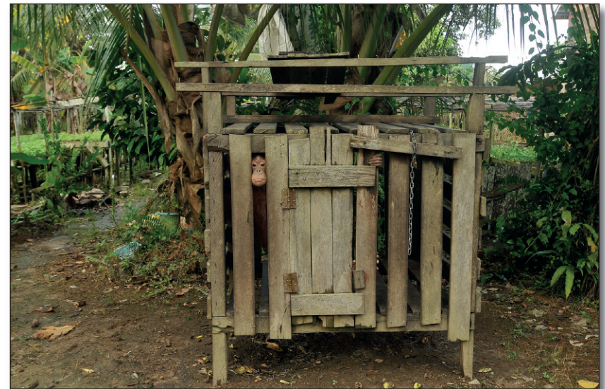
Aged about five or six Memo was rescued in Sebulu, East Kalimantan. A blood test later confirmed Memo is infected with Hepatitis B.