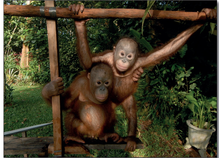
Momo and Mimi (l-r) looking a lot happier and healthier now they are in a rescue centre.