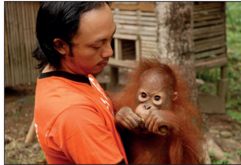
Newly rescued this baby enjoys its first fresh fruit in a long time.