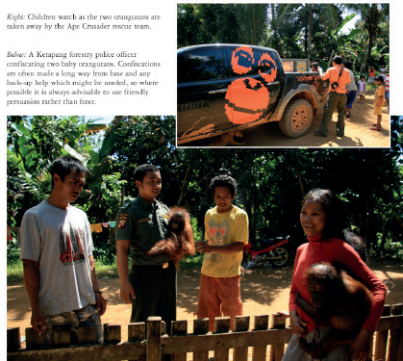
Right: Children watch as the two orangutans are taken away by the Ape Crusaders rescue team.