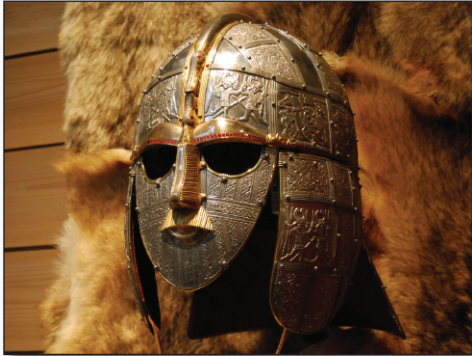
The Helmet of Rewald , the King of East Anglia, who died in AD625, is the most famous of the Sutton Hoo finds.