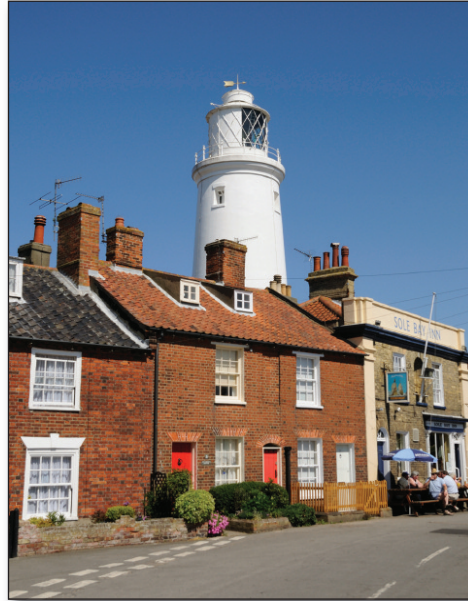
Above: Southwold Lighthouse has guided ships on a safe path since it first became operational in September 1890.