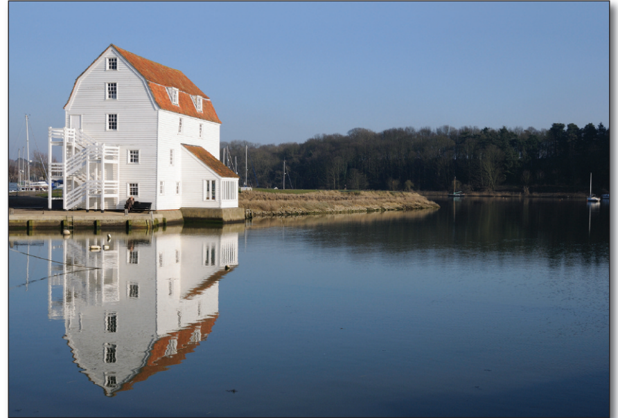
The iconic tide mill is Woodbridge's most famous building.