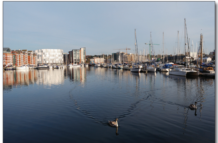
Yachts and residential buildings now take the place of the former docks.