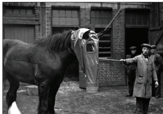
The importance of providing horses with protection from poison gas was quickly realised and experiments were made with several types of gas mask using a variety of materials.