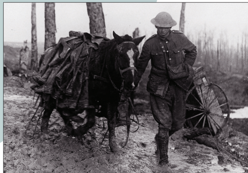
Wading through deep mud a soldier leads a horse laden with trench boots up to the front line.