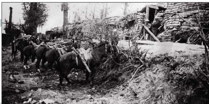
Right: A line of horses, fully equipped, waits at the back of a heavily sandbagged dugout at the entrance to which stand some troopers in a relaxed pose.