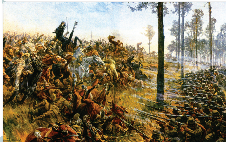
A fanciful depiction by a German artist of German troops repulsing the attack of British cavalry in the form of the 18th Hussars and 4th Dragoon Guards at Thulin, 1914. Much exaggerated – the actual event was relatively minor – the artist gave the German public what they wanted – heroism of the infantry in the face of massed cavalry attack.