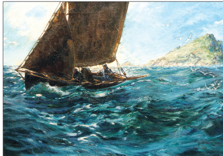
A Stiff Breeze.