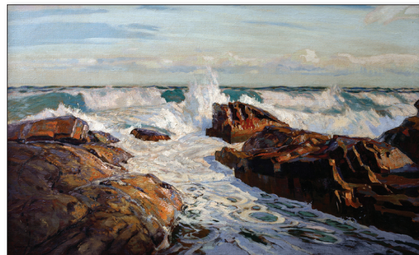
Morning Light, St Ives.