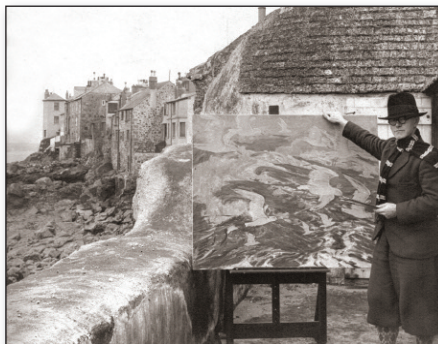
Above: Borlase Smart on the Ocean Wave Studio balcony.