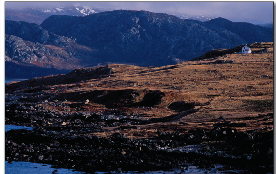
From Laide skirting the back edge of Gruinard Bay, the coast is lined with further old crofting townships with names such as Sand, First Coast, Second Coast and others long forgotten or abandoned in some of the small woodlands now growing along the shore.