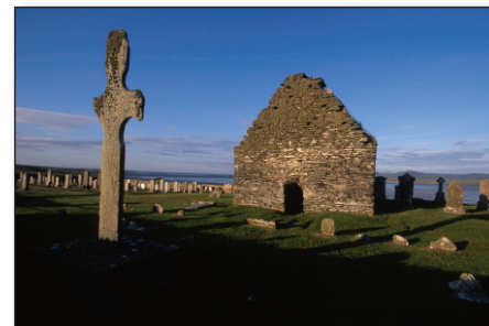
Right: Evening light on the ruins of Kilnave Chapel on the west shore of Loch Gruinart with its cross dating back to about AD 750.