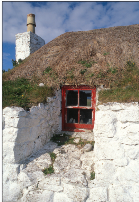
Left: Traditional thatched cottage near Middleton now used as part of a heritage museum.