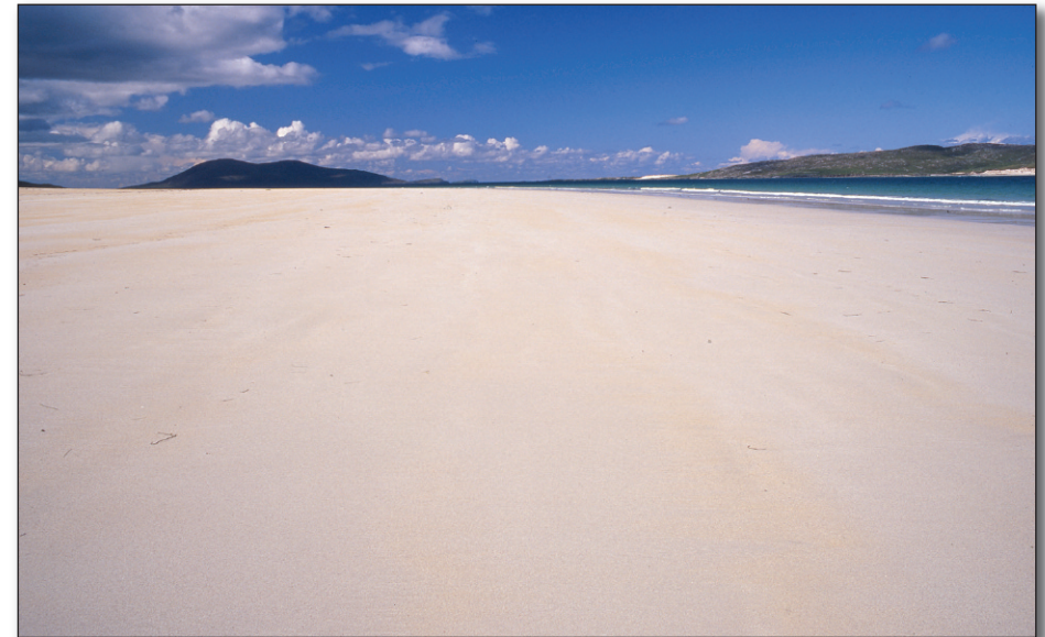
Tràigh Rosamol, Harris. The view looking south along Tràigh Rosamol to the distant 339m Toe Head on the south-west corner of Harris.