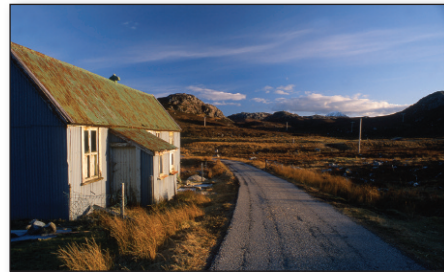
Below: Late afternoon on the minor road following Loch Inchar from Rhiconich to Achlyness and Rhimichie.