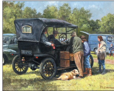
Chipping Steam Gathering Acrylic 7 x 8½in