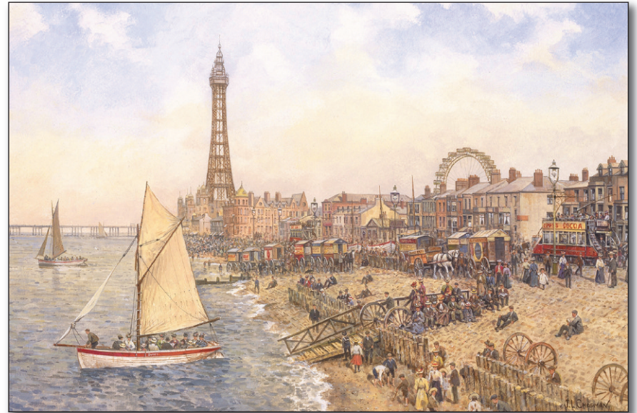
Blackpool Seafront, circa 1900 Acrylic 13½ x 19in