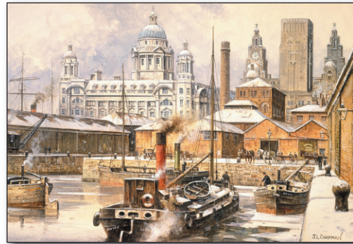
Right: Canning Dock in Winter Gouache 8 x 11½in