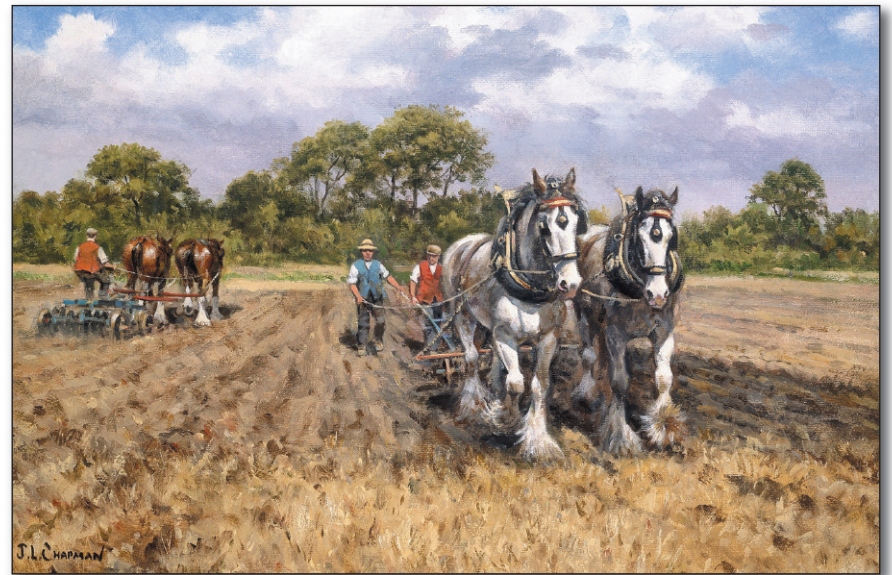
Ploughing at Clieves Hill, Ormskirk Oil 10 x 14in