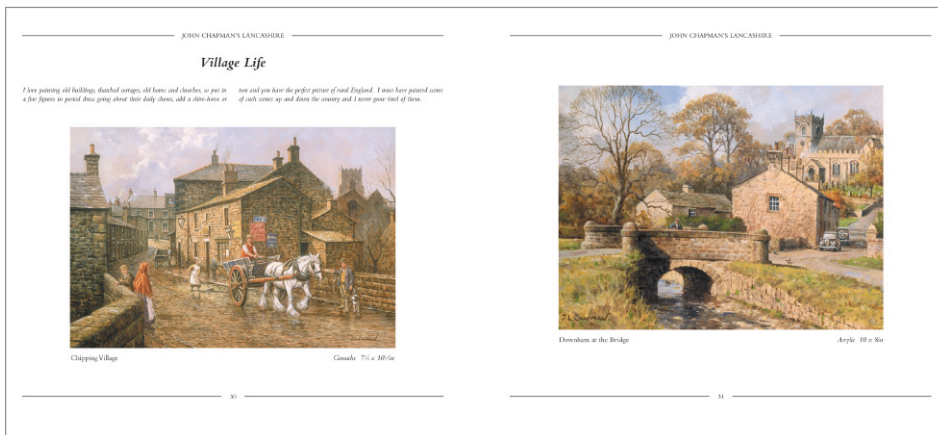
Example of a double-page spread.