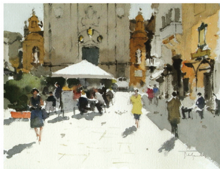
A Square in Victoria, Gozo 12" x 16"