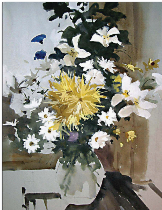
Floral Mixture, 24" x 18"