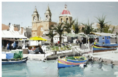
The Yellow Canopy, Marsaxlokk, Malta 14" x 20"