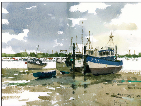
Small Craft at Brightlingsea, 12" x 16"