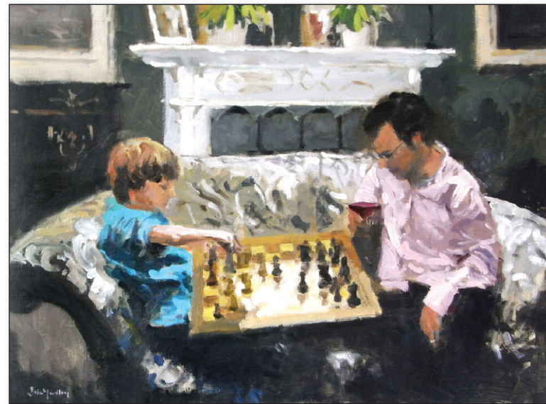
Nephew versus Uncle, 18" x 24"