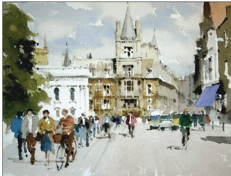
The Purple Blind, Cambridge, 12" x 16"