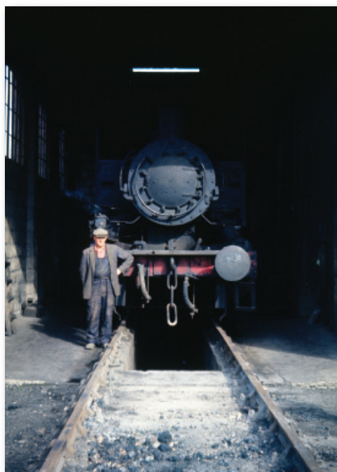
The day's work is done. DS234 retires to its shed, and the shunter kindly poses for a photograph beside the locomotive. September 1965.

Right: Battle of Britain Pacific No 34089 602 Squadron heads along the single track of the Swanage branch between Corfe Castle and the seaside terminus. 18 June 1967.