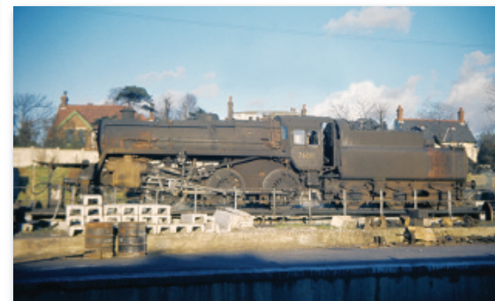
Bottom right: The low sun highlights the wheel and high running board of BR Standard Class 4 2-6-0 No 76011 in this broadside of it on Bournemouth motive power depot's turntable, behind the up platform. 10 December 1966.