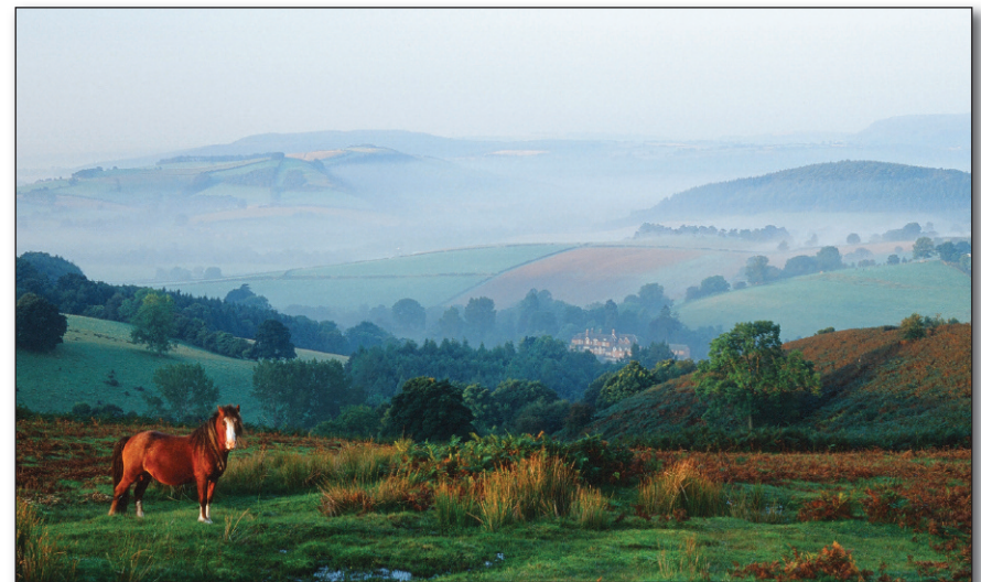
The Clun Hills and Valley

Looking down the Bath Valley from Jonathan's Rock. Legend has it that a driver called Jonathan used to meet his lady here, and flung himself to his death one day when she failed to turn up.