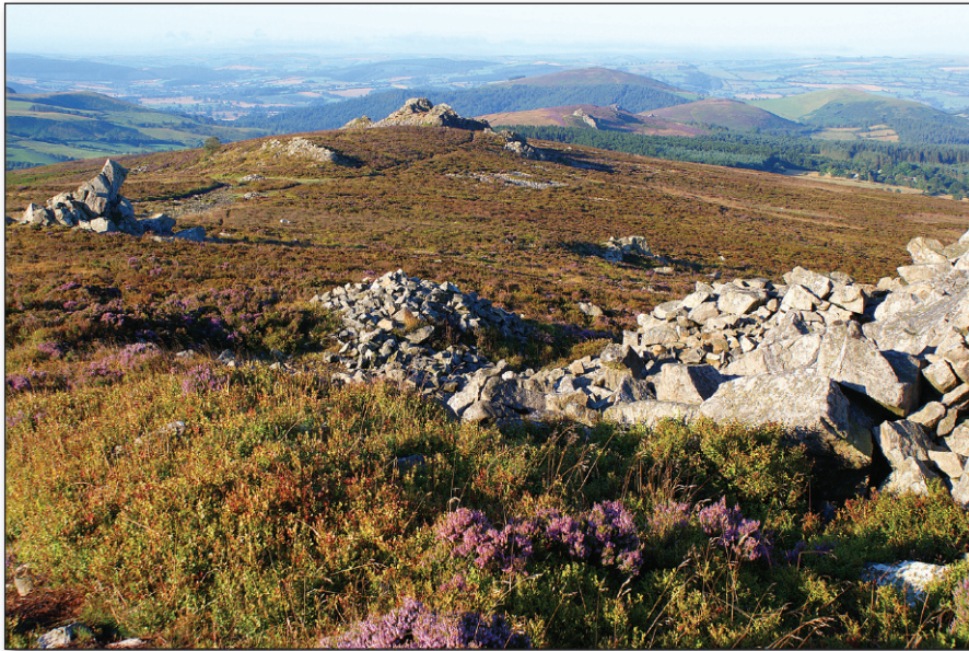
Looking South from Manstone Rock