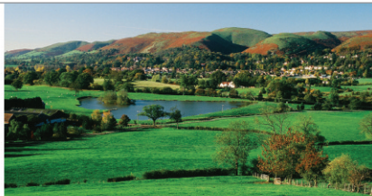
The Long Mynd and Church Stretton from Caer Caradoc