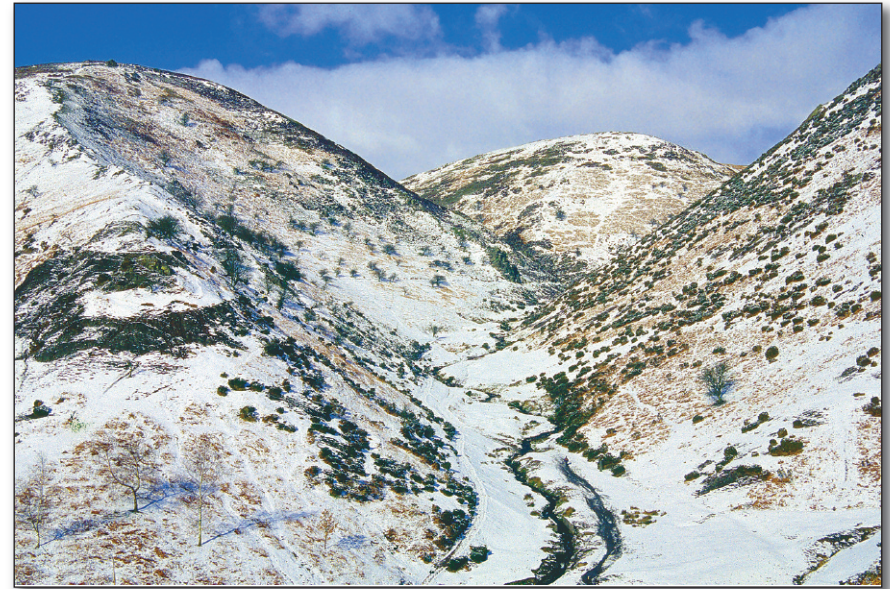
Carding Mill Valley in Winter.