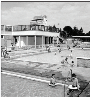
The popular Bridgwater Lido.