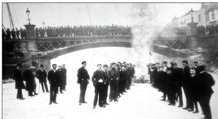
Right: Ox roast on the River Parrett, 1895.