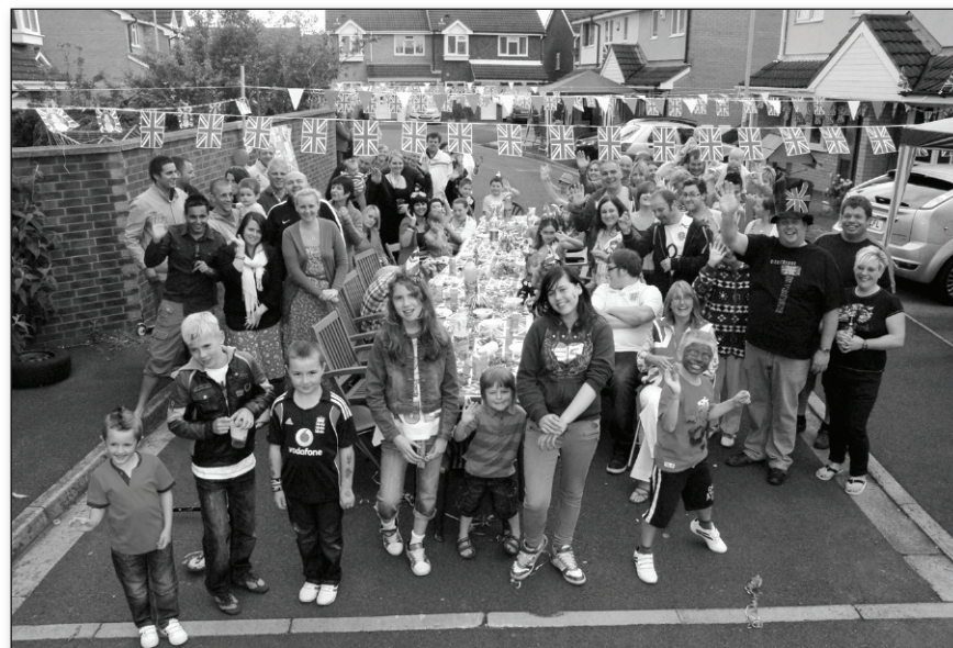
Residents of The Copse celebrate with a Diamond Jubilee street party, June 2012.