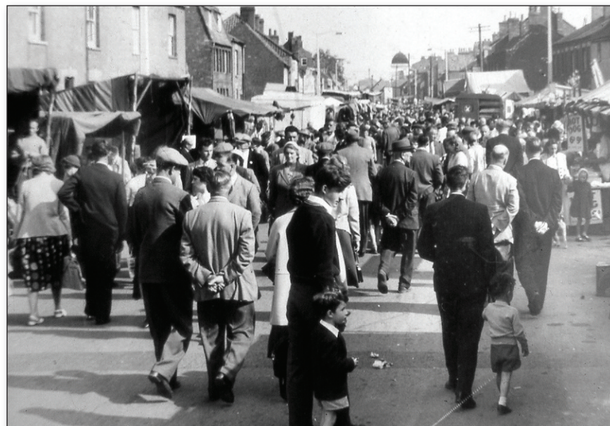
West Street during Bridgwater Fair in the 1950s.