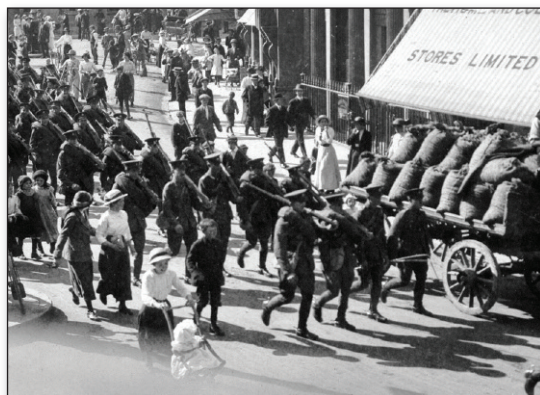
The local Army Service Corps in 1914 marching to the railway station on their way to war.