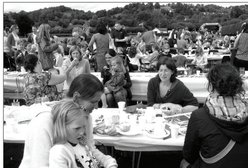
Dulverton Diamond Jubilee Sportsfield tea, June 2012.