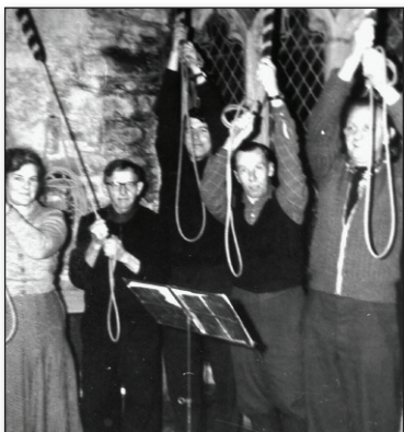
Bell-ringers at Brushford Church, 1950.