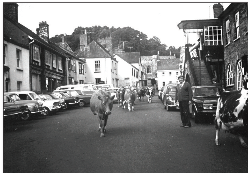
Fore Street in 1974 – Jack's cows returning to the field after milking.