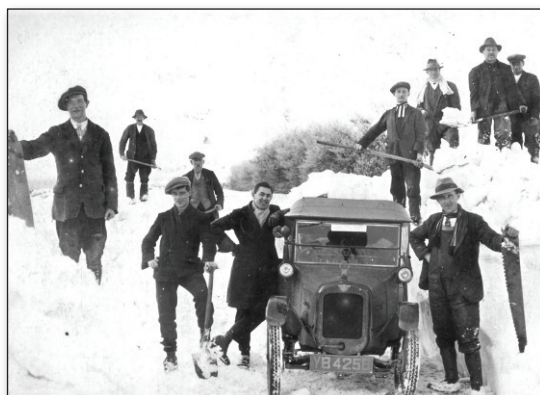
Clearing the snow, 1947.