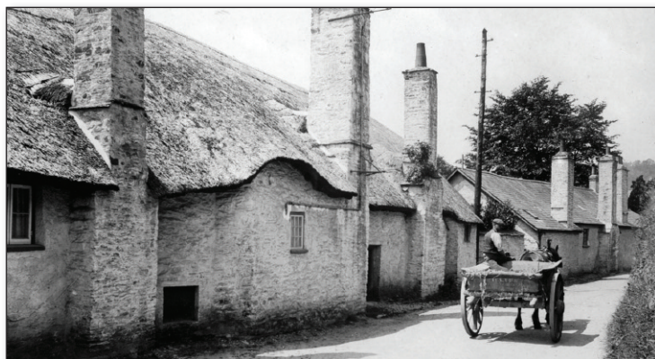
Right: Woodleigh Chimneys, one of the oldest dwellings in Dulverton.