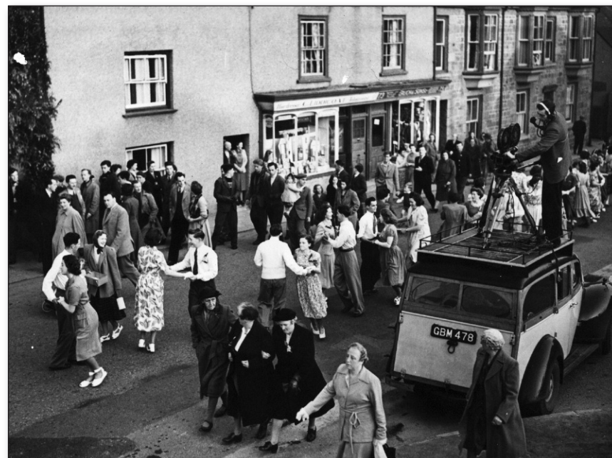
Filming Flora Day at the early-morning dance in Meneage Street, early 1950s.