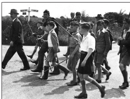
Above: Beating the bounds, 1934.