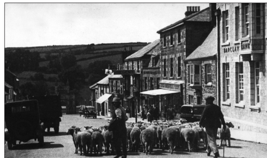
Farmers driving their sheep to market, c.1930s.