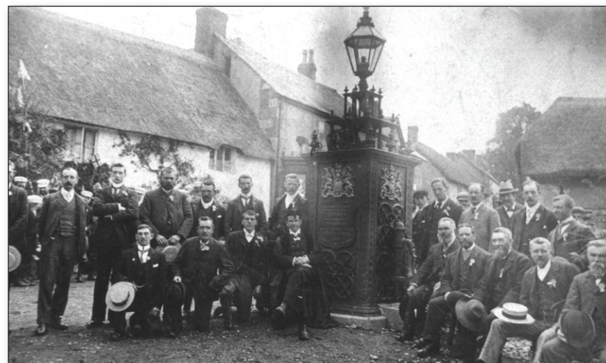
The Coronation Committee, by the newly erected Hemyock Pump on 14 August 1902.

Right: A selection of the shorthorn calves after distribution in Hemyock Market which was behind what is now the Catherine Wheel.