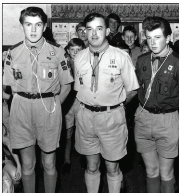
A Scout meeting in the Church Rooms, 1967.