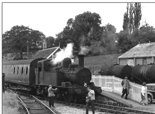
The last passenger train to leave Hemyock, 9 September 1963.