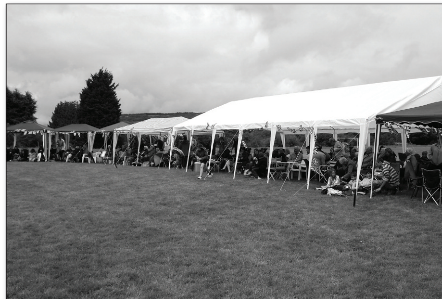
The congregation take cover at the open air service, Diamond Jubilee celebrations, June 2012.