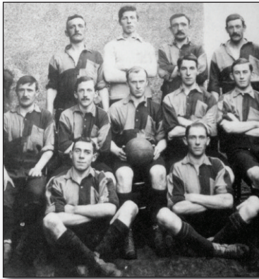
Minehead Football Club, 1900–07.