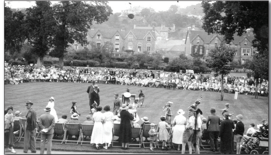
A fancy-dress parade in Blenheim Gardens, c.1936.

Right: The Lifeboat being brought up through Blenheim Road on Lifeboat Day.