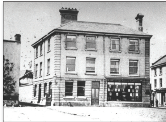
Wellington Square before 1893.