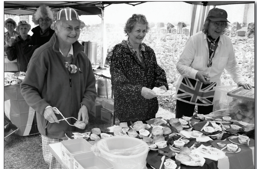
The Jubilee Street party was enjoyed by old and young with entertainment and cream teas, June 2012.