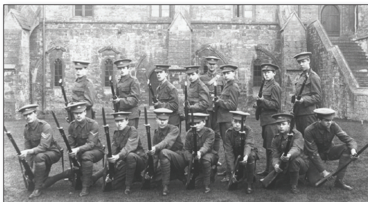
Right: Officer cadets at Sherborne School defending the Chapel steps before departing for the First World War.