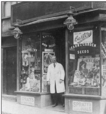
Fincken's corn and seed merchants, on the east side of Cheap Street, in 1900.