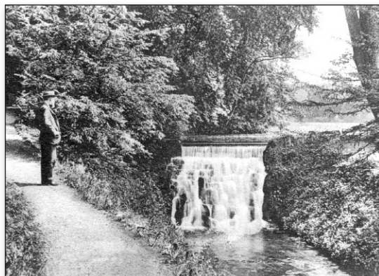
Sherborne Park waterfall – known as the Cascade – in 1905.