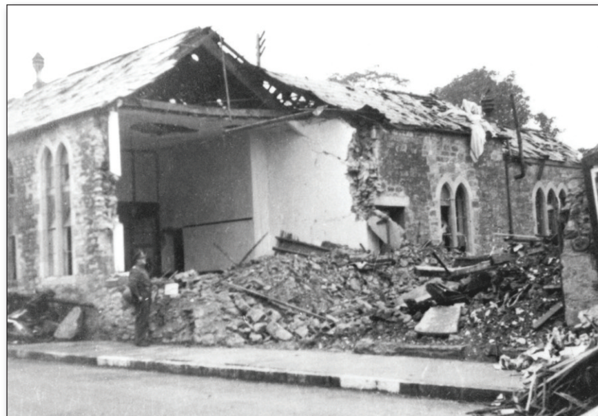
Children at Foster's Infants School in Newland had just gone home when the Luftwaffe visited Sherborne on 30 September 1940.