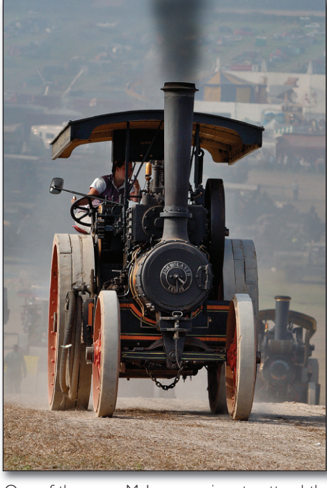
One of the many McLaren engines to attend the McLaren Special Event in 2010 was No. 1534, a 5NHP compound traction engine seen cresting the hill in the Heavy Haulage Arena.