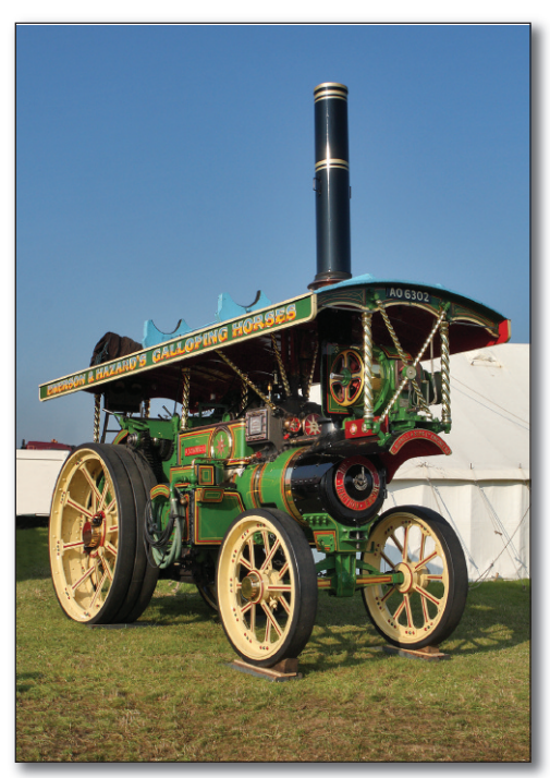
The only Burrell Showman's Engine ever to leave the works painted green is 'Lightning II' No. 3256.