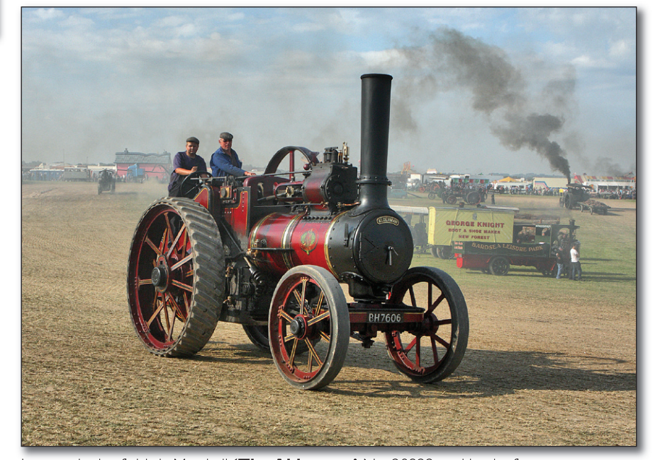
In a workaday finish is Marshall 'The Alderman' No. 28922, making its first appearance at the Great Dorset Steam Fair in 2011.