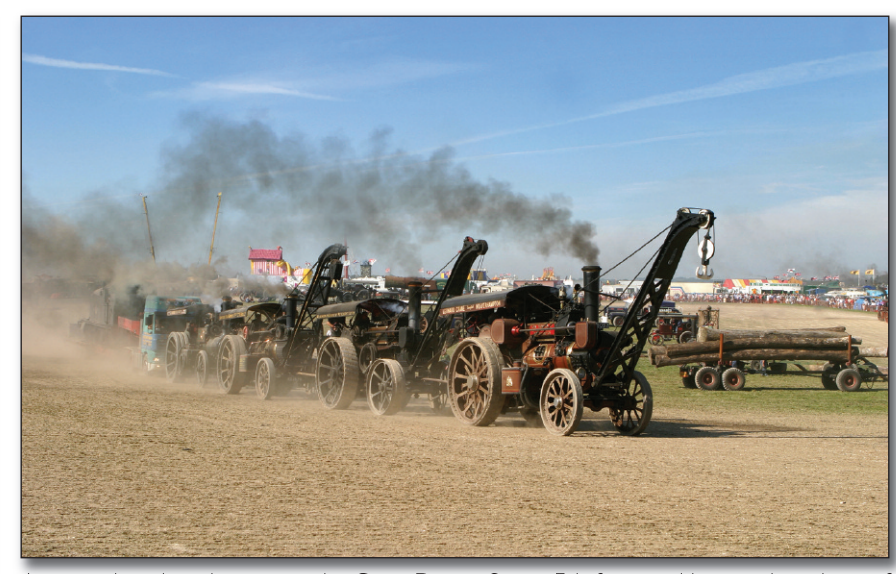
A spectacle only to be seen at the Great Dorset Steam Fair, four road locomotives, three of which are Fowler Crane Engines.