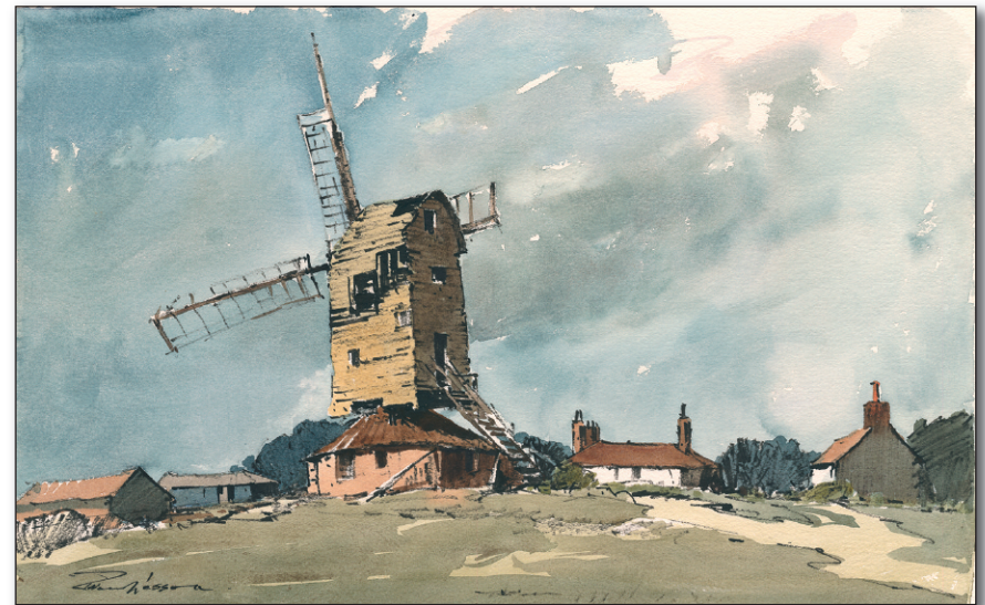
Old Mill at Foulness 13"x20"