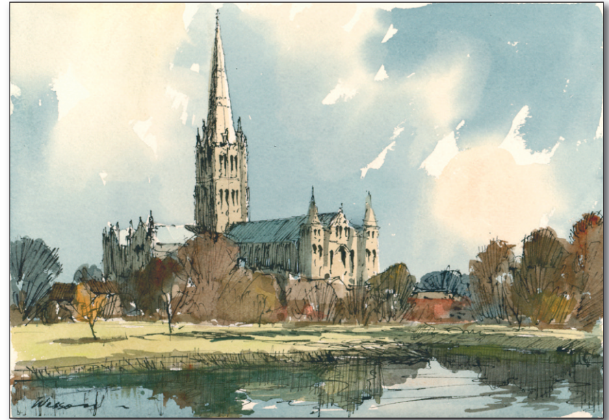
Salisbury Cathedral from the North West 10"x14"