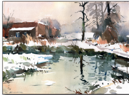
Snow at Netley Mill 13"x20"