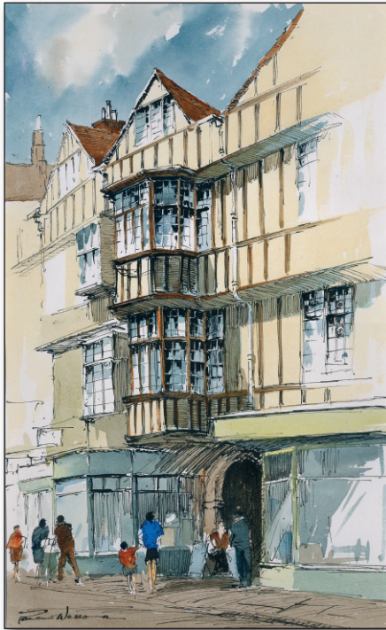
Staple Inn, Holborn 20"x13"