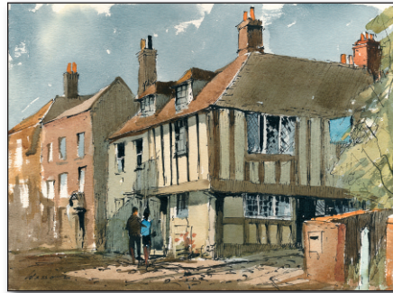
A Corner in Rye 10"x14"