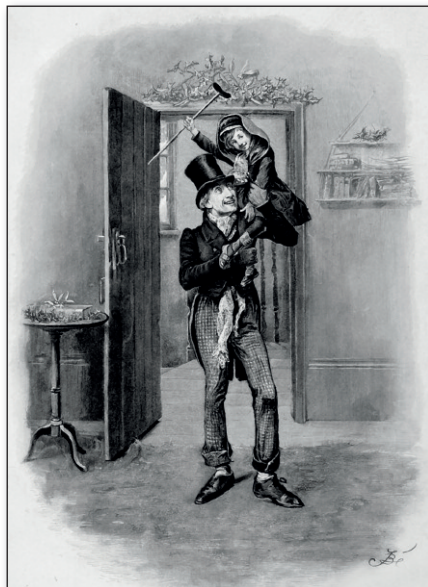
Above: Tiny Tim by Frederick Barnard, published as frontispiece to the 1870 edition of A Christmas Carol .

Right: Satis House . The home of Miss Havisham in Great Expectations . It is also across the road that Dickens was last seen alive three days before his death, leaning on a fence and gazing at the house.