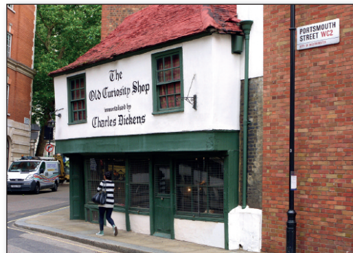
One possible location for The Old Curiosity Shop , although some experts think it may have been nearer to Tottenham Court Road.

Right: Satis House . The home of Miss Havisham in Great Expectations . It is also across the road that Dickens was last seen alive three days before his death, leaning on a fence and gazing at the house.