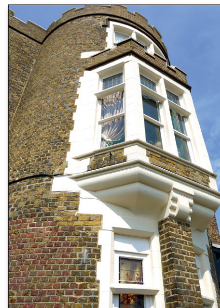
Left: The front room of Bleak House from which Dickens would look out across Viking Bay.