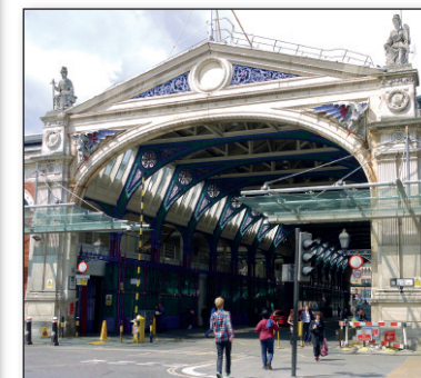
Below: Smithfield today – in past centuries, the place for hangings, torture, and markets of several sorts.