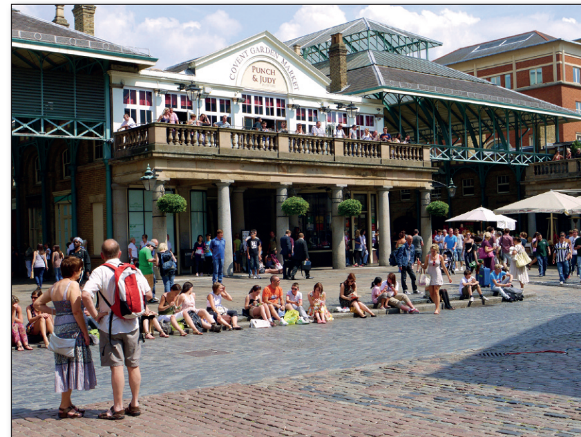
Covent Garden, where Dickens would sometimes rent rooms and where he had his encounter with the man with the large meat pie in his hat.