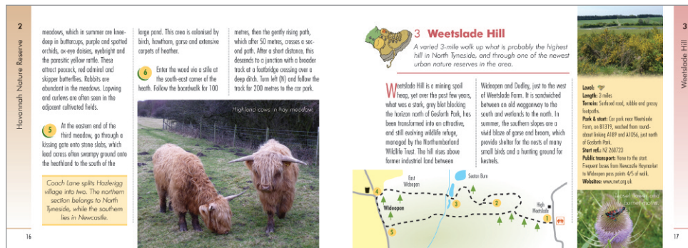
Example of a double-page spread.