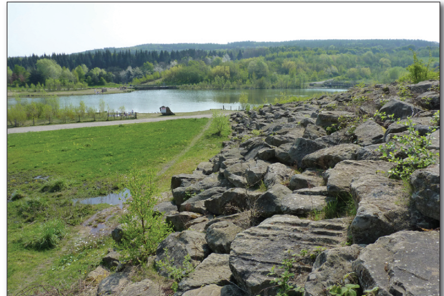
Boulder slope and lake, Watergate Forest Park.