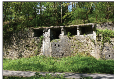
Ruins of Bessie Drift Mine.