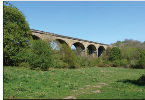
Nine Arches viaduct from Lockhaugh Meadows.