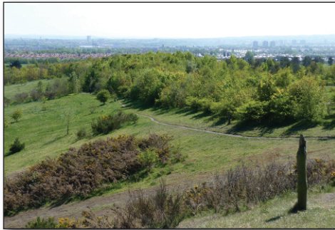
Urban view from Rising Sun Hill.