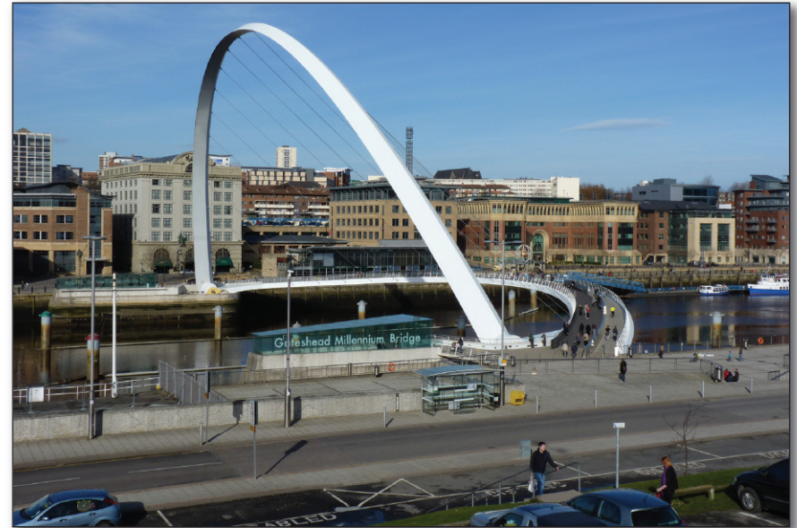
Gateshead Millennium Bridge.