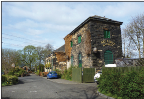
Big Lamp Brewery, Newburn.