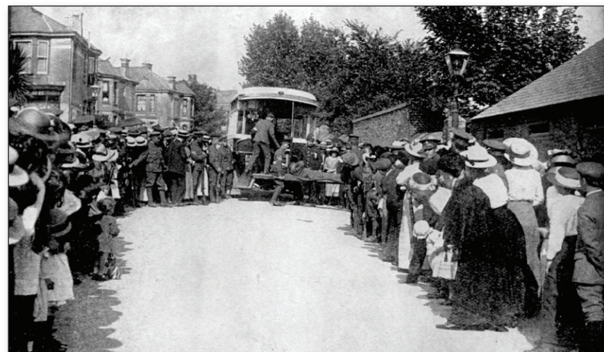
Curious Plymouthians crane forward as a stretcher is unloaded from an ambulance (a converted London bus) outside the Salisbury Road Hospital, 1914.