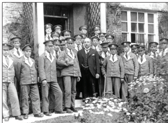
Soldiers convalescing at Elm Park Hospital, Totnes, 1915.