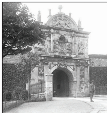
A soldier on guard at the gates of the Citadel, Plymouth c.1914.