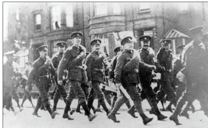
Troops marching through Torquay c.1917.

Right: Red Cross nurses in a makeshift hospital ward in a church at Barnstaple, 1914.