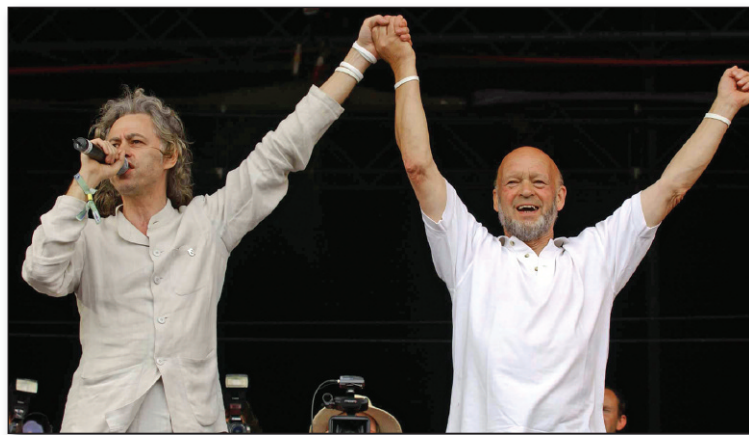
Right: Michael Eavis making a very rare appearance on the Pyramid stage with Bob Geldof.