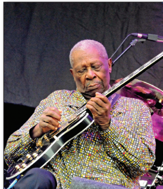
BB King on the Pyramid stage.