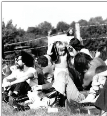
The inaugural festival in 1970.