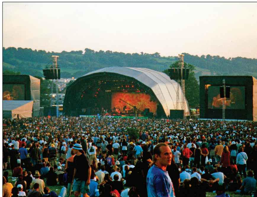
1999 heralded glorious sunsets with 100,000 plus enjoying a great weekend.