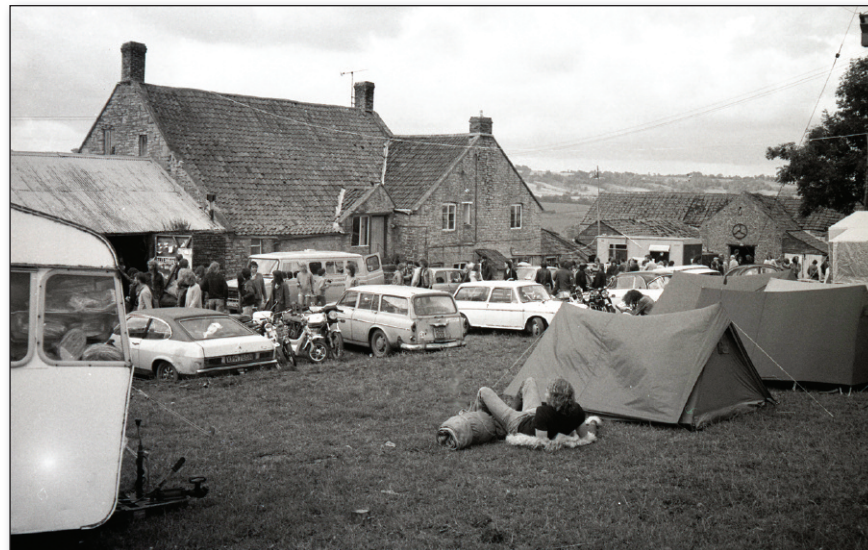
Worthy Farm 1984.