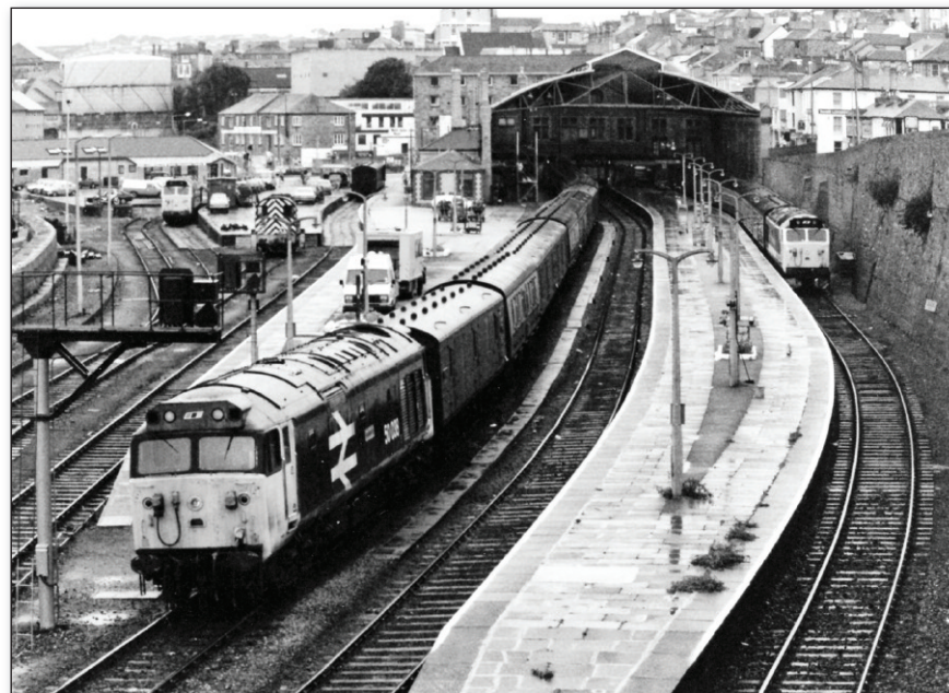
The date is October 1983 and the location is Penzance platform 3.