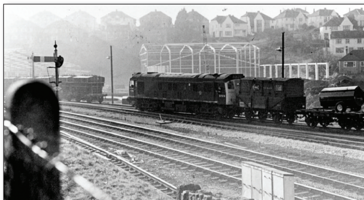
Right: This interesting photo dates from circa 1973 and shows D7574 shunting a train at Truro Yard.