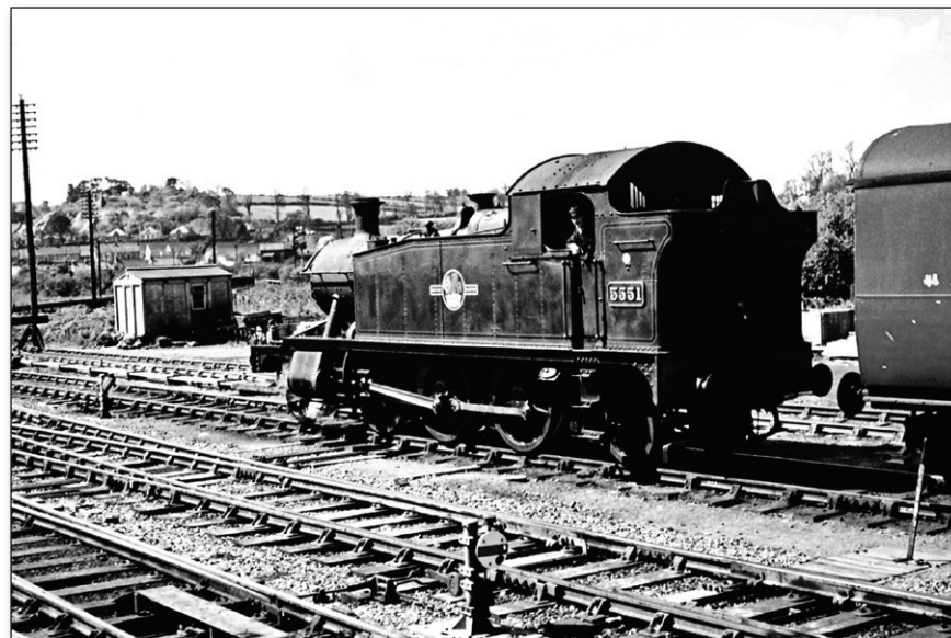
5551 shunting coaching stock at Par.