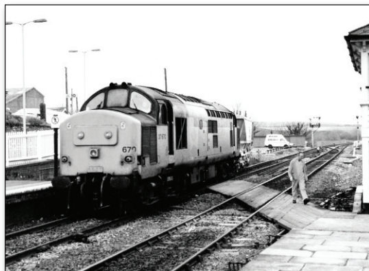
An excellent picture of 37670 about to bring its train of china clay off the branch connection at Liskeard.