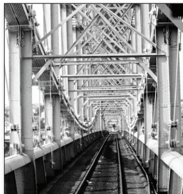
The awe inspiring and magnificent Royal Albert Bridge linking Devon with Cornwall.