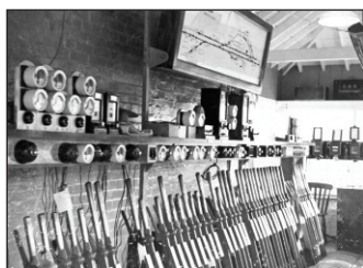
The Truro (East) Block Shelf in 1971.