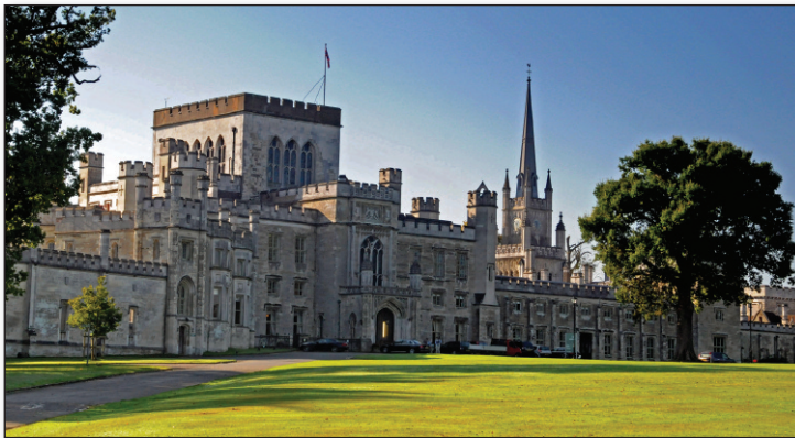
Right: Ashridge House, now a Management College.