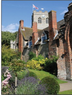
Beautiful gardens surround the almshouses and church at Ewelme.