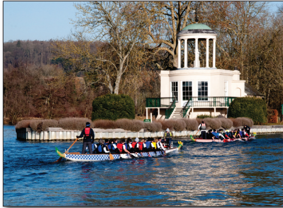
Dragon boats race on the Thames at Temple Island.