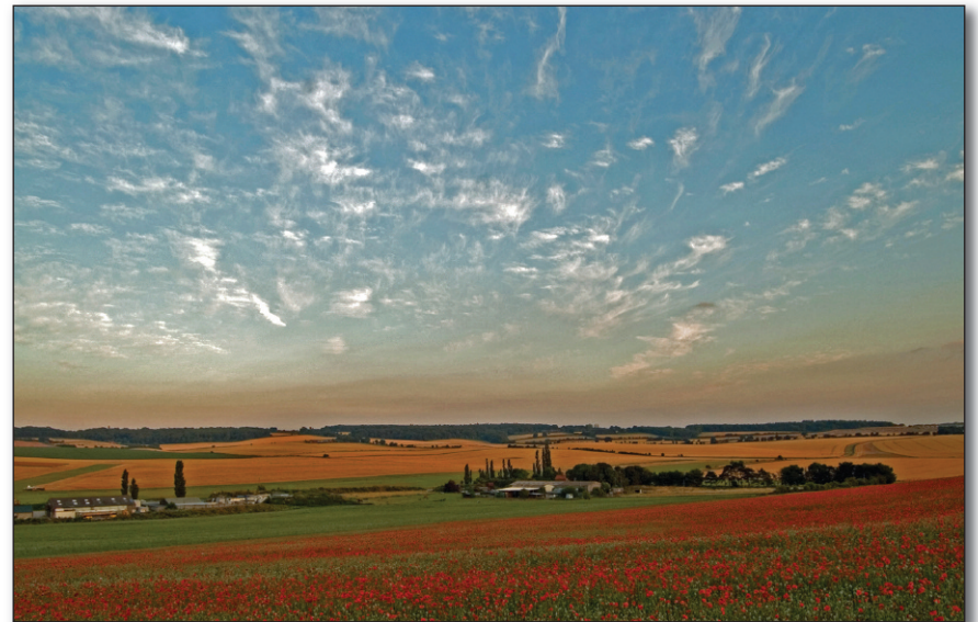
Poppies in the evening near Woodcote create an almost Italian vista. Left: Example of a double-page spread