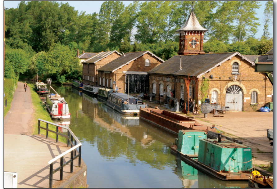
The canal wharf at New Mill in Tring.