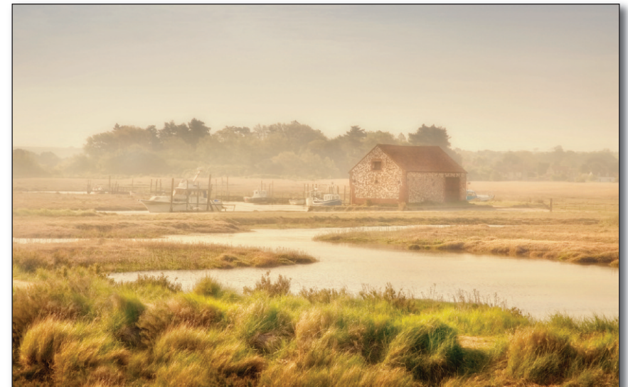
Mists roll over Thornham marshes.