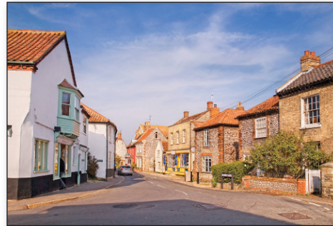
Cley village centre.