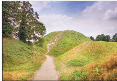
The mound – motte – of Thetford Castle was reputedly made by the Devil as he scraped off his boot having just created the Fen-dyke at Weeting.