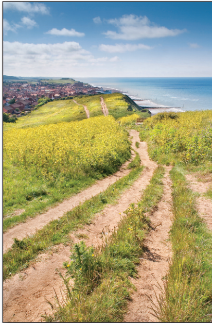
Marvellous views to Sheringham from Beeston Bump.