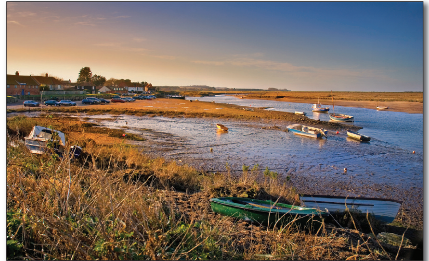
Dusk gathers on the village of Burnham Overy Staithe.