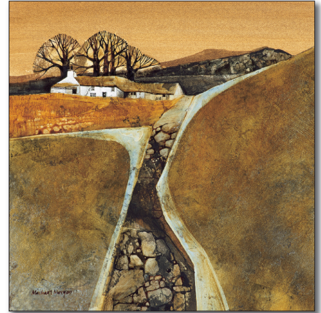
Whitewashed Cottage, watercolour 37x37cm