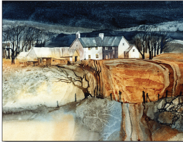
Moorland Farmhouse, Variation Three, watercolour 30.5x40cm