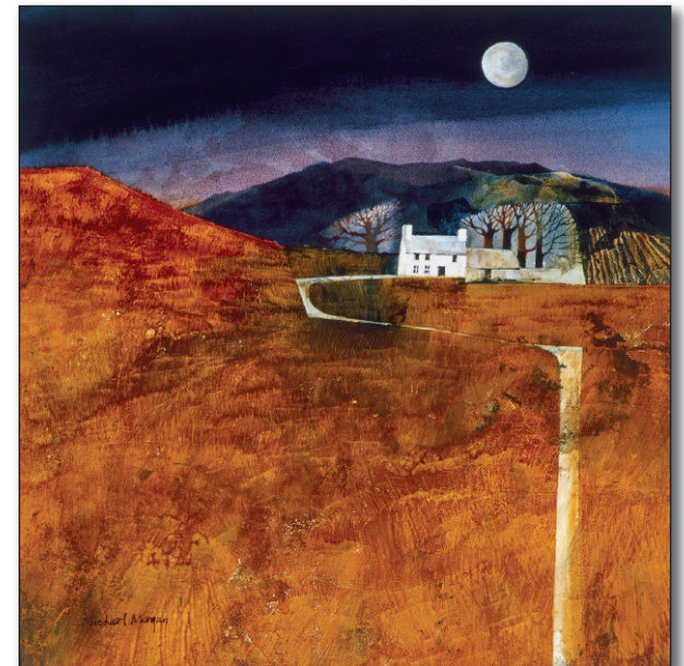
Farm with Five Trees, watercolour 37x37cm