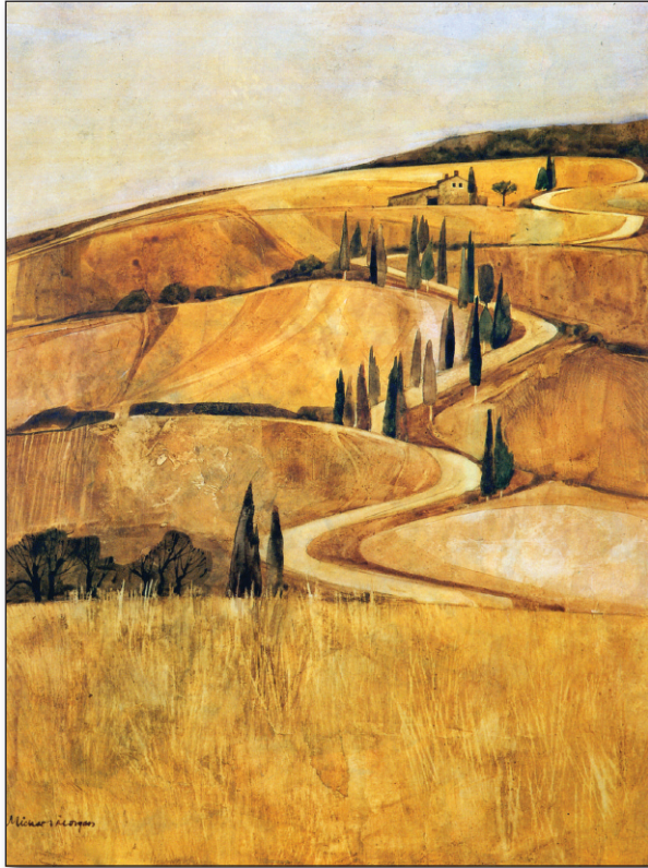
Winding Path, Tuscany.