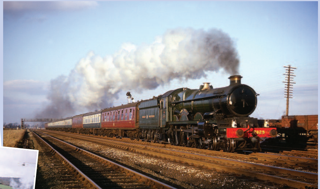
Above: Castle Class, No.7029 "Clun Castle" speeds southwards through Rossett at the foot of Gresford Bank.