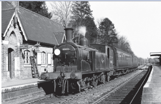
Small steam locomotive pulling a train through a landscape.