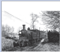
Small steam locomotive pulling a train through a landscape.