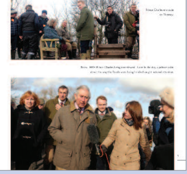
Example of a double-page spread.