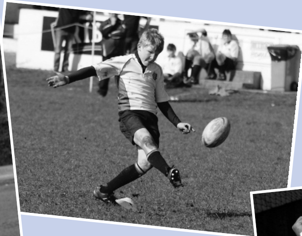
Left, above, and right: Matches & Events 1990-2013