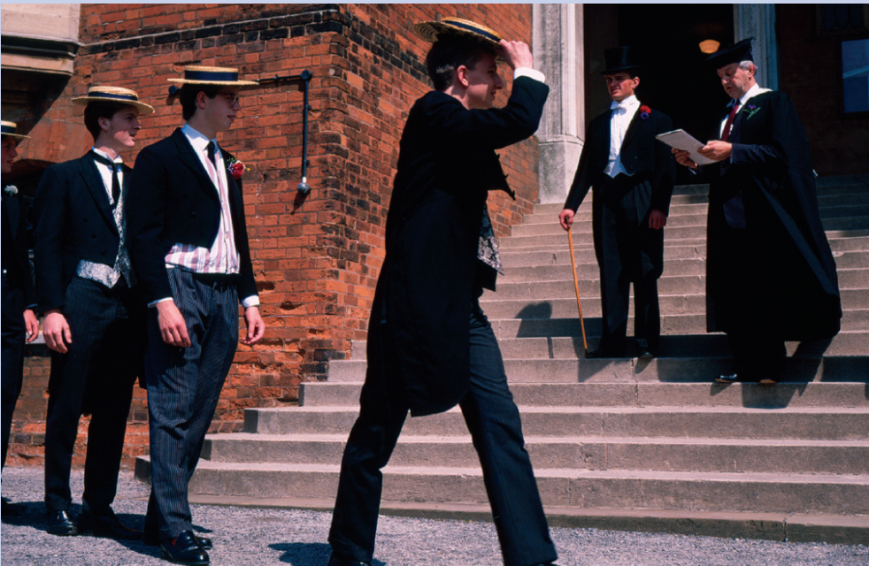
Harrow School. Calling the register is known as 'Bill', and takes place in each house daily. However, on Speech Day, it is a more ceremonial occasion where the whole school files past the Headmaster and Head Boy, raising their hats as their name is read out.