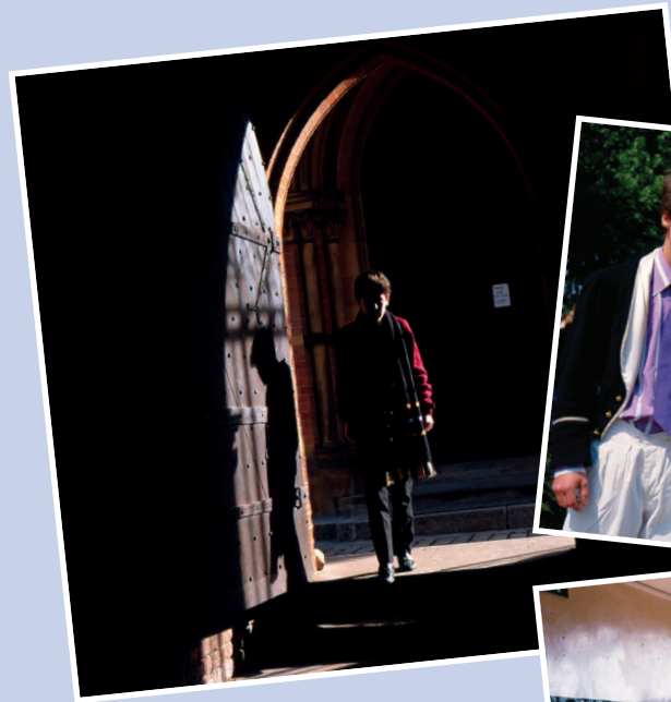
Above: Wellington College. A Wellingtonian in his College scarf.