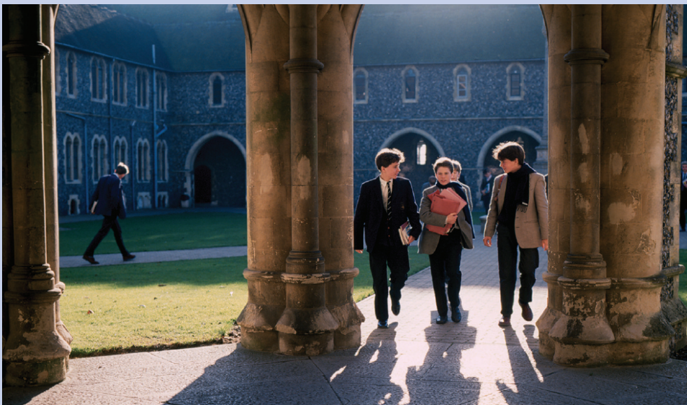
Lancing College. Boys crossing Upper Quad between lessons and passing under Great School's Octagon Porch.