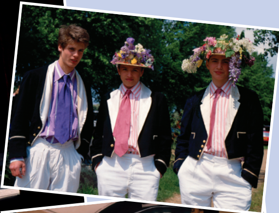
Below: Eton College. Rowers, or wet bobs, in their traditional naval uniforms worn for the procession of boats on the Fourth of June.