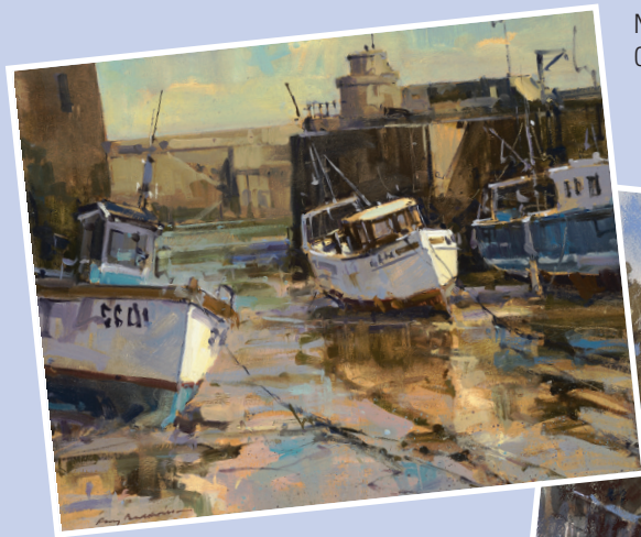
Newquay Harbour Oil 12x14in (30x36cm)