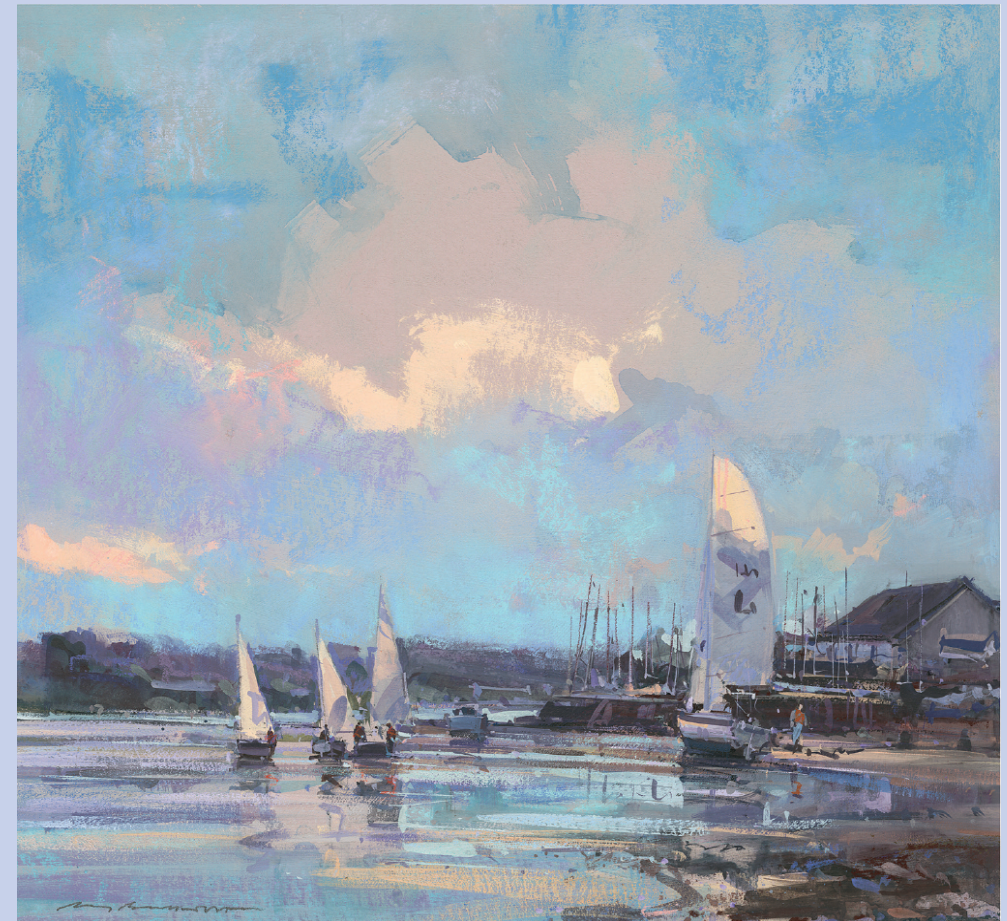
Evening Sail on the Exe Mixed Media 17x17in (43x43cm)