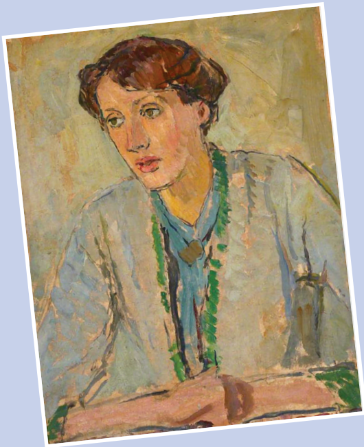
Above: Portrait of Virginia Woolf by Vanessa Bell 1912