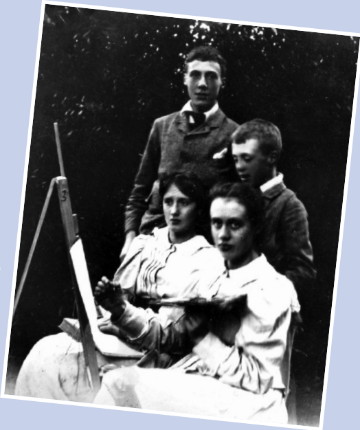
Right, below: Vanessa's Studio