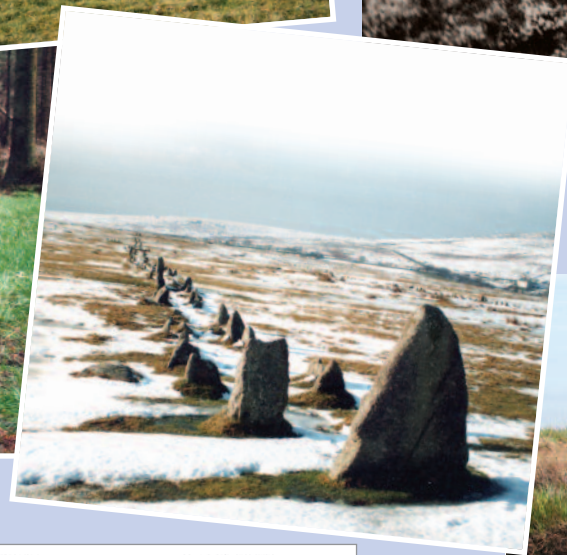
Left: Merrivale Row B.