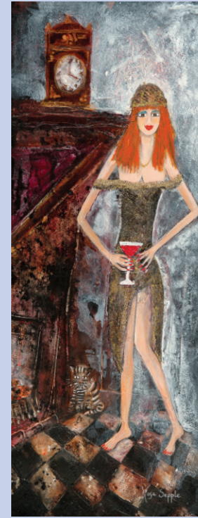
Below right: 'The Circus Comes to Town' was published on the front cover of the Society of Women Artists 2013 exhibition catalogue.