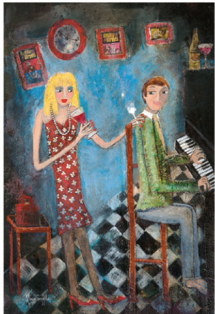
Piano Man 50x30cm

"I long to see someone smile when looking at my work", for then I know they have made that special connection."