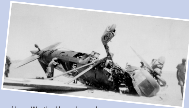
Above: Westland Lysander crash.